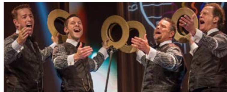
Sunshine District's Main Street stole our hearts and earned first place medals.