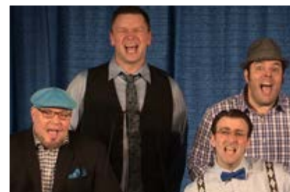
'Round Midnight cracked the Top Ten!