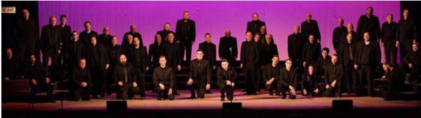
DARK HORSE — MidAtlantic District's Parkside Harmony, singing without noticeable direction, wowed the crowd — and the judges! — at the BHS International Convention in Las Vegas last week, earning 5th place medals.