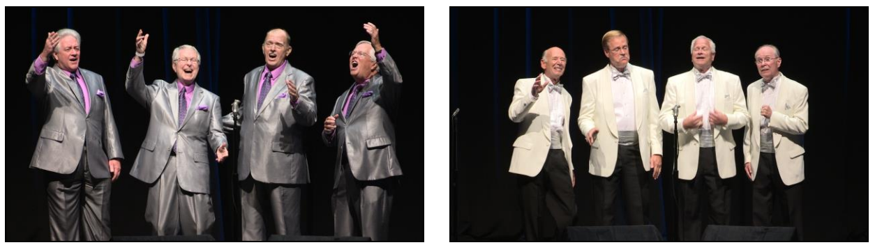
Youth Reclamation Project