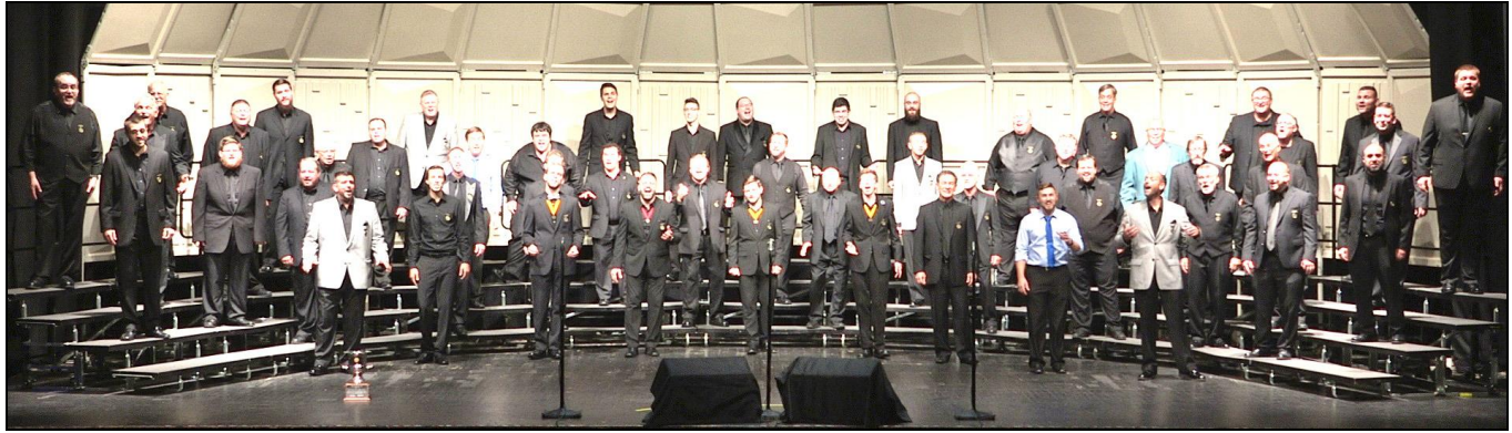
Parkside Harmony w/ trophy