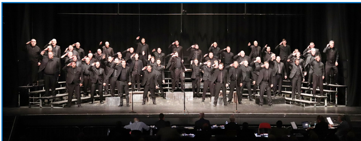
1 st Place – Parkside Harmony (Hershey, PA)

✚ The 2020 Mid-Atlantic District Chorus Champions ... PARKSIDE HARMONY!!!