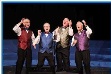
Quirks of Art