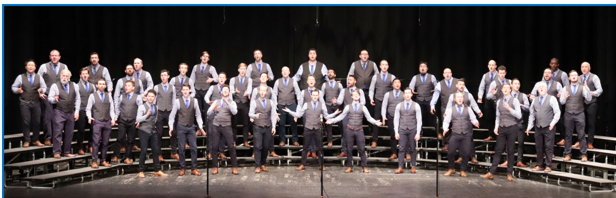
2 nd Place – Voices of Gotham (Hell’s Kitchen, NY)