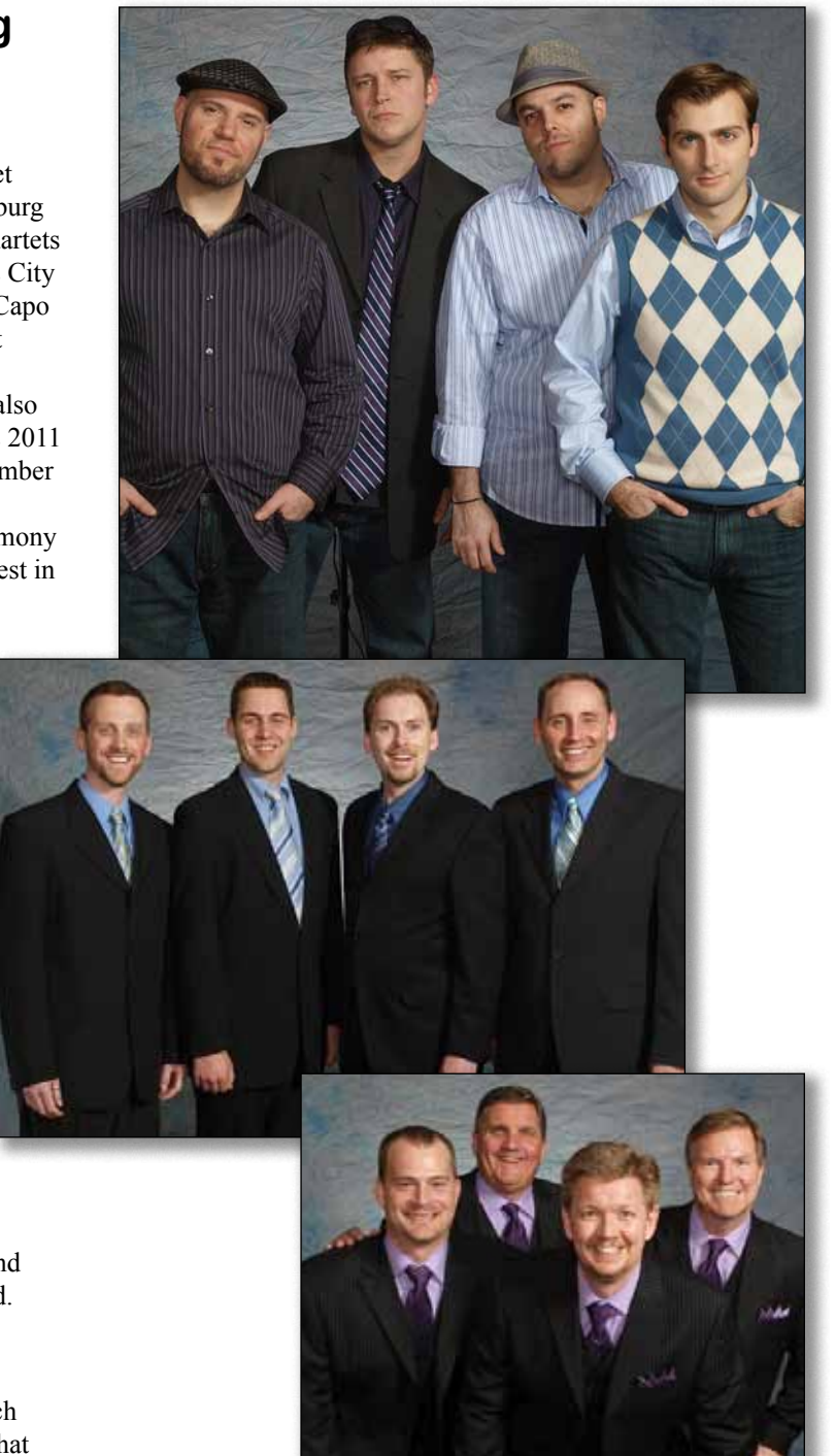
Three quartets qualified to represent the Mid-Atlantic District at the International Convention in Kansas City this summer: (from top) 'Round Midnight, Da Capo and Frank the Dog.

Please remember to re-read the articles on contest copyright requirements that have appeared on the BHS web site and in