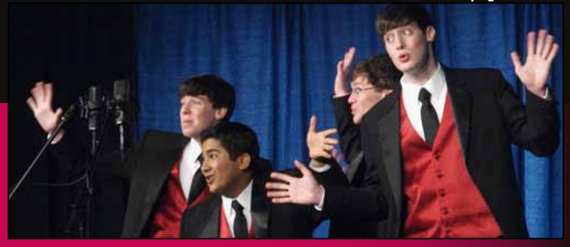
YIH— Most Wanted wows crowd with a "superior" performance. See page 7-11