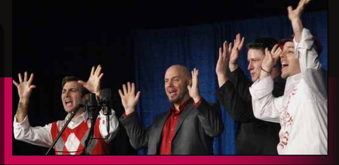
QUARTET PRE-LIMS — 'Round Midnight "shouts" for joy. See page 6

a bulletin for every barbershopper in the Mid-Atlantic District