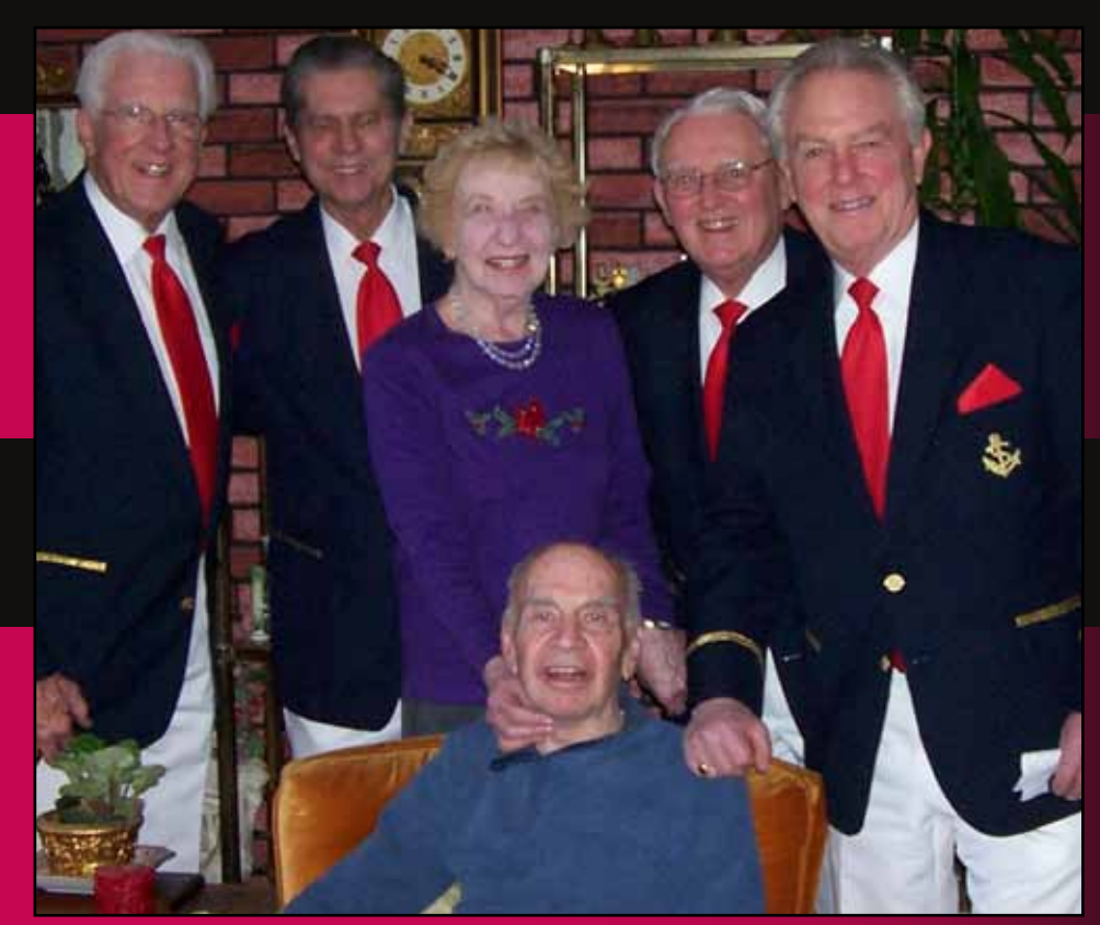
MY VALENTINE — Chorus delivers love message to same couple for 12 years. See page 16-17