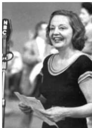
Tallulah Bankhead signs off "The Big Show" by reciting the first lines to Meredith Willson's May the Good Lord Bless and Keep You.

The advent of television rapidly finished off all of these three.