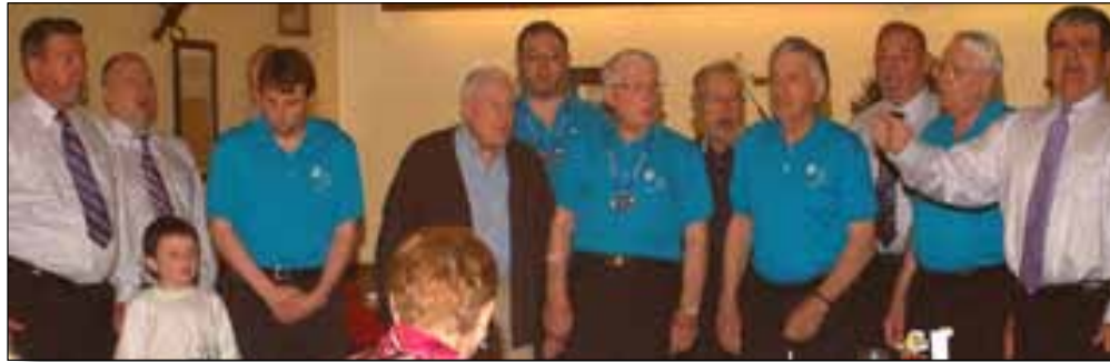
White Rose Chorus members entertain at installation.

In addition, the chapter held its 2011 officer installation dinner this spring. This was the first such installation for the organization in several years -- a huge step forward in reversing the recent trend of diminishing enrollment for this and a great many society chapters across the country. The installation of officers was conducted by Mid Atlantic