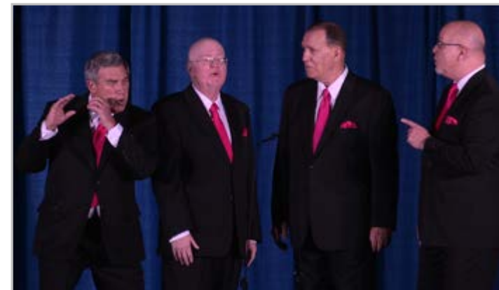
AMERICAN IDLE earned the District Senior Quartet Champion title in Parsippany.