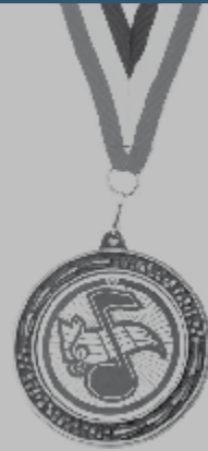
THE GOOD OLD DAYS