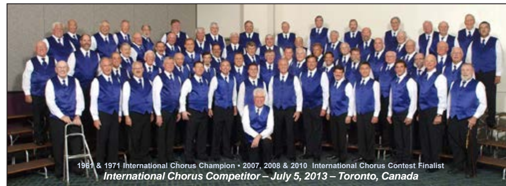
1981 & 1971 International Chorus Champion • 2007, 2008 & 2010 International Chorus Contest Finalist International Chorus Competitor – July 5, 2013 – Toronto, Canada

...presented by: The Dundalk, Maryland Chapter of the Barbershop Harmony Society