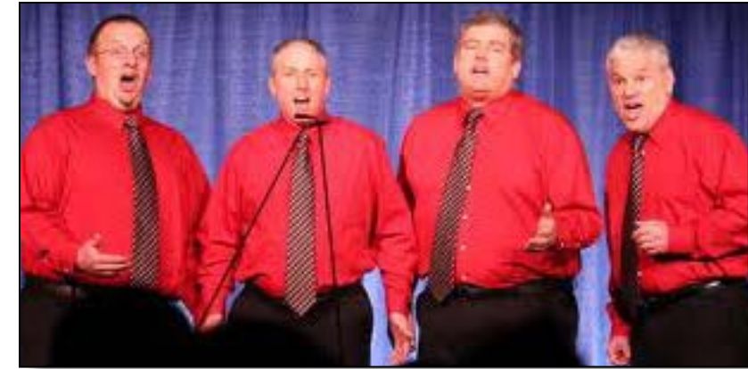
Cross Keys Connection sings Let Me Call You Sweetheart on a live newscast Feb. 13 on NBC-10 in Philadelphia.

We are pleased to have been able to provide our services for this oppor-