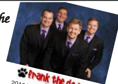
Frank the Dog barbershop with a side 2013 Mid-Atlantic District Quartet Champion

A NEW LOCATION Saturday – May 11, 2013 – 7:30 PM A NEW LOCATION Parkville High School / 2600 Putty Hill Ave. / Parkville, MD 21234 I-695 Exit 31A Harford Rd, South / 0.6 mile right onto Putty Hill Ave., 0.4 mile to school on the right.