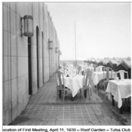
Location of First Meeting, April 11, 1938 – Roof Garden – Tulsa Club