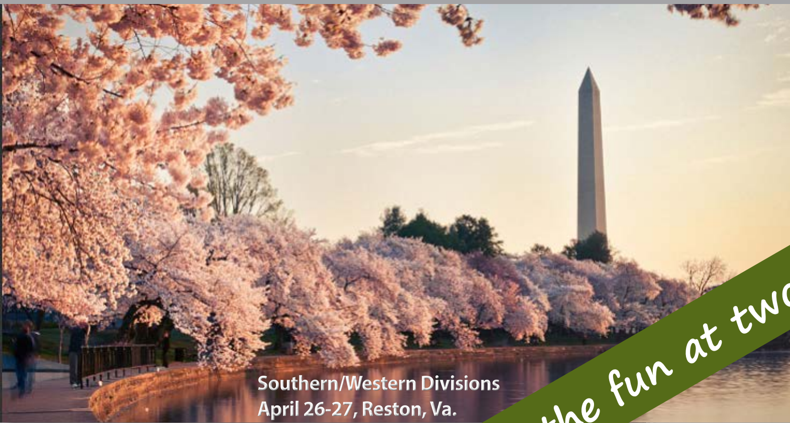
Southern/Western Divisions April 26-27, Reston, Va.

Combined Southern/Western Division Convention April 26-27, 2013 Hyatt Regency Reston Town Center 1800 Presidents Street, Reston, Virginia 20190