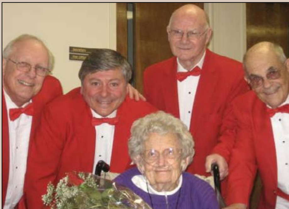
AFTER DARK delivers a singing valentine to a smiling centenarian.