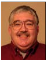
by Jim Botelle, M-AD Historian

Early barbershoppers adopted this term to refer to the purest form of barbershop harmony. So it means to take a well-known tune and harmonize to it, using only your ears and skills to make great music ... all without a piece of