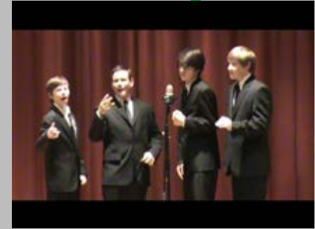
Last year's competition winner, The Taminators, showing their championship form.

Come and cheer on this year's quartets from Lenape, Tamanend, and Unami Middle Schools