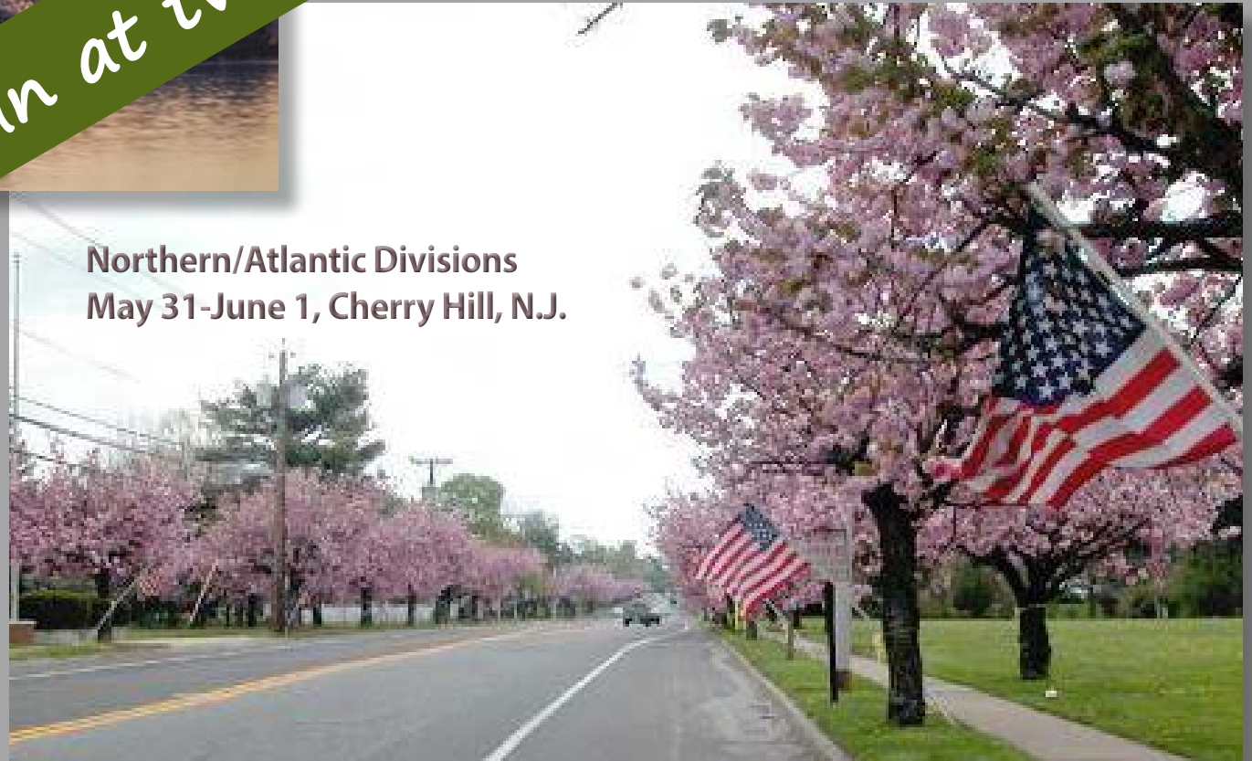
Northern/Atlantic Divisions May 31-June 1, Cherry Hill, N.J.

Double the pleasure, Double the fun at two Double Division Conventions!