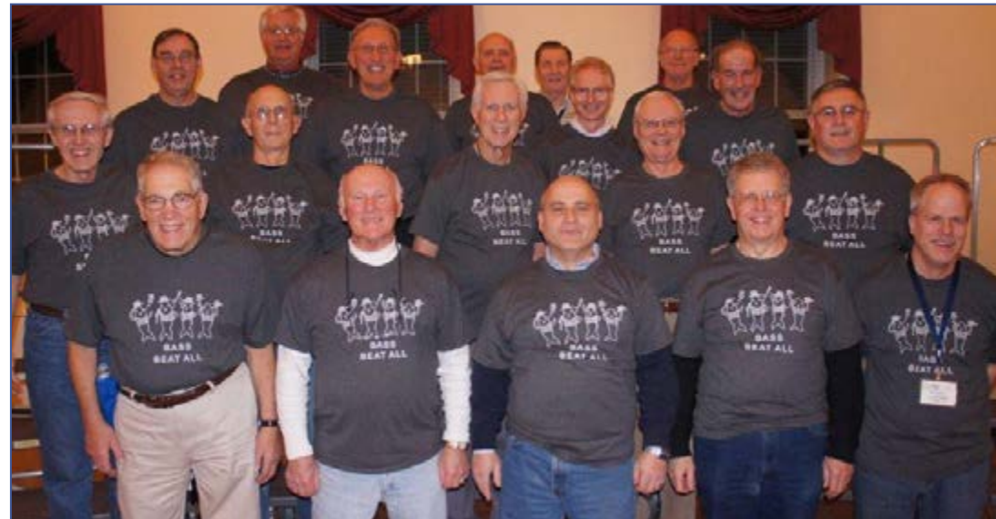
North Pennsmen Chorus's MANLY basses proudly wear the BASS BEAT ALL T-shirts they won in an intra-chorus membership competition.

Some guys, especially Basses, can be highly motivated by the chance to win free T-shirts!