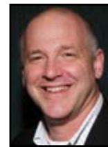
2013 CONTEST AND JUDGING UPDATE

In the past, we have gotten a low return rate on such evaluation requests. Rest assured that critical feedback will be handled with care so that the feedback source remains anonymous beyond the C&J VP. When you compete in a contest this spring or next fall, please make it a priority to complete the post-contest evaluation and return it to me. The M-AD contest and judging program and I need your feedback.