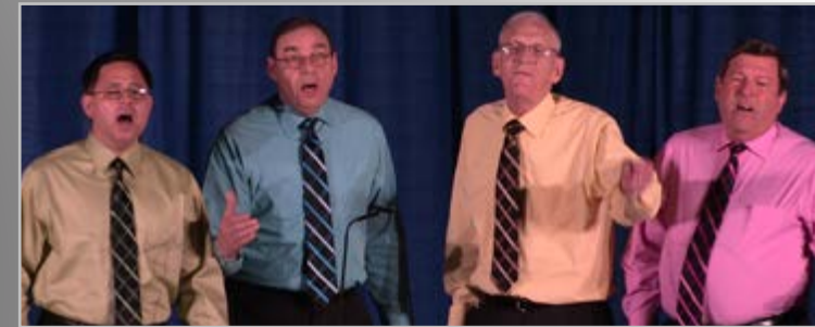
FOUR TRAK SOUND