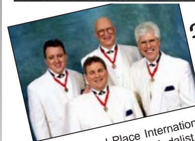
BSQ 3rd Place International Quartet Medalist