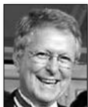
by Roger Tarpy, VP Music & Performance

If you're lucky enough to have all this in place, then you'll surely be blessed, eventually, with an enthusiastic and competent group of singers, enviable contest scores, and, most important of all, a string of distinguished performances in your community.