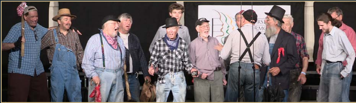
ABINGTON-LEVITTOWN BUCKSMONT SQUIRES OF SONG