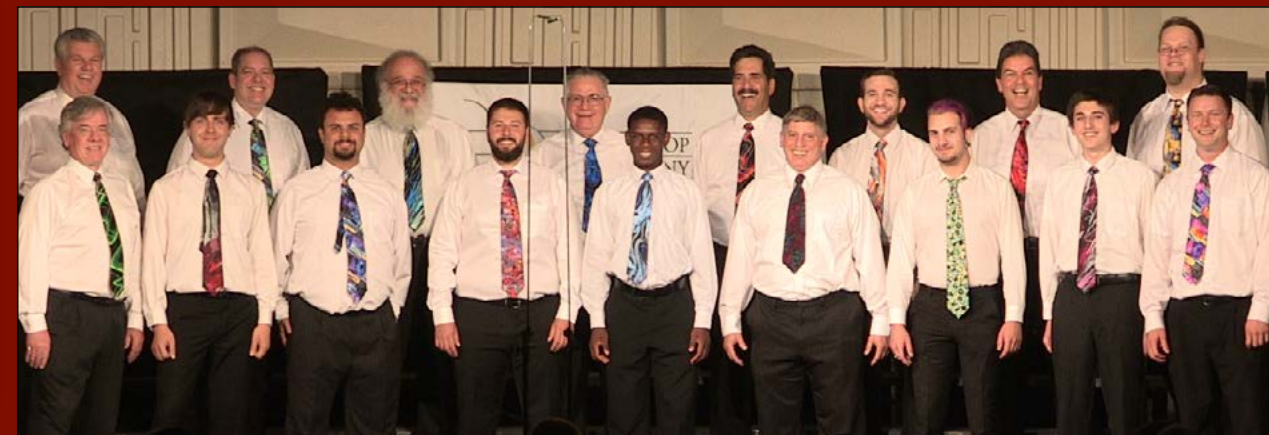
FIVE TOWNS COLLEGE LONG ISLAND SOUND