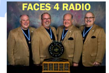
2014 Senior Quartet Gold Medalist, BHS