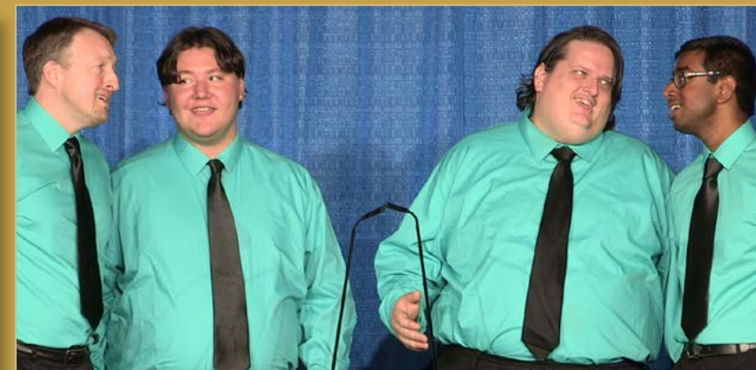
MISFIRE (Novice Champions)