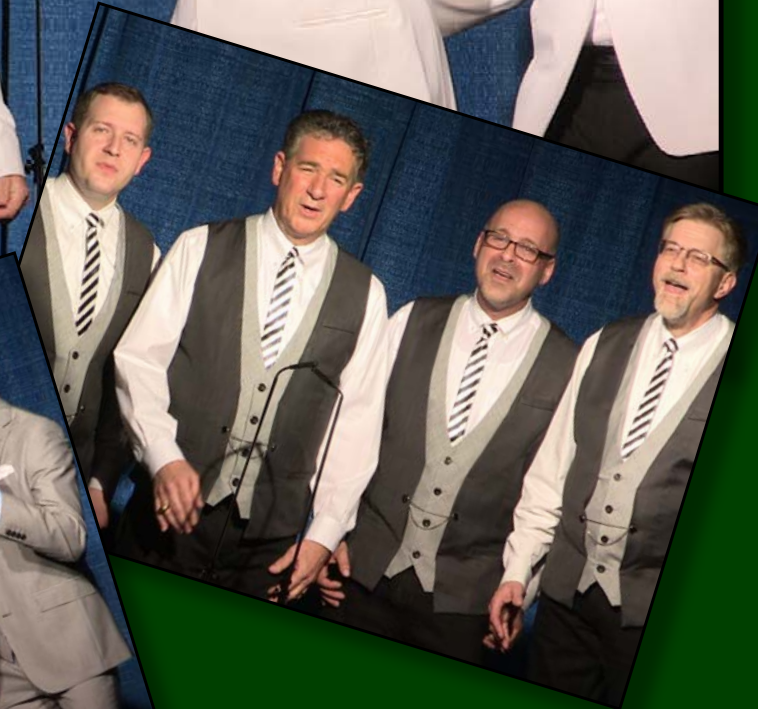
1st Place: ROUTE 1