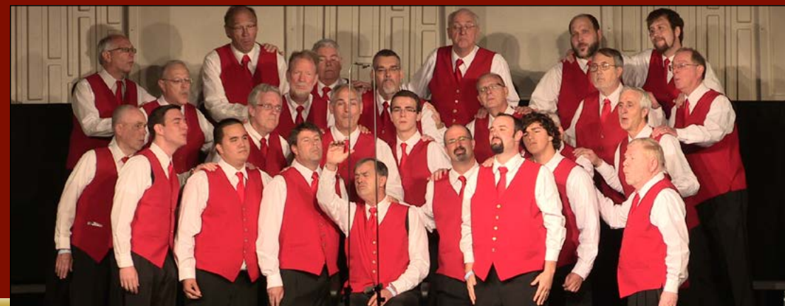
ALLENTOWN-BETHLEHEM LEHIGH VALLEY HARMONIZERS (MOST IMPROVED)