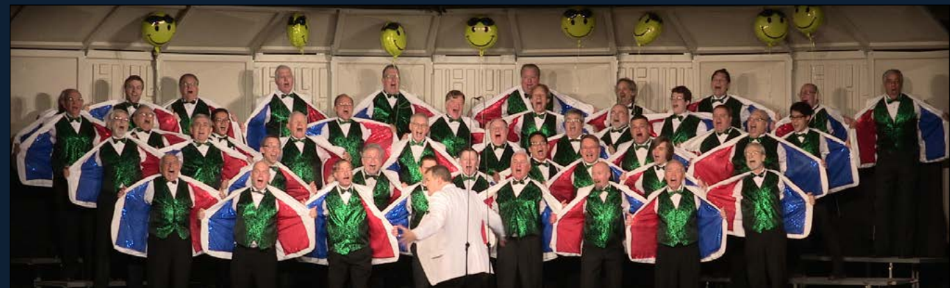
CHERRY HILL PINE BARONS (Plateau AAA CHAMPION, MOST IMPROVED CHORUS)