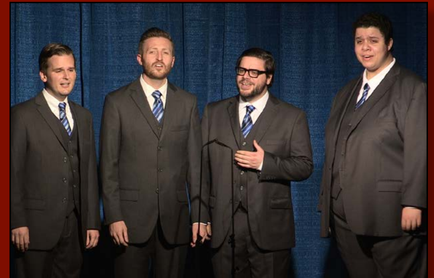
QUARTETS in order of appearance, L-R from TOP: Oasis, Cohesion, The Weekawkin Wonder Boys; Ta-Dah! (OOD), Riverline (OOD), Parkside Not Pictured: Vocal Standard and Susquehanna Flats