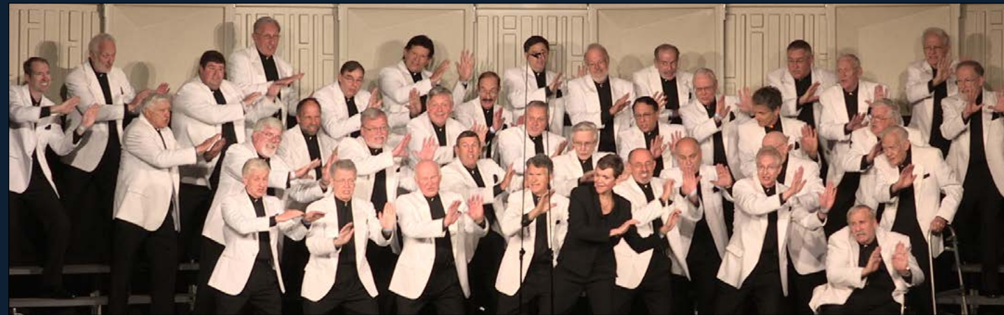
LANSDALE NORTH PENNSMEN ATLANTIC DIVISION CHAMPION