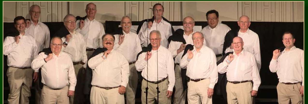
READING PRETZEL CITY CHORUS