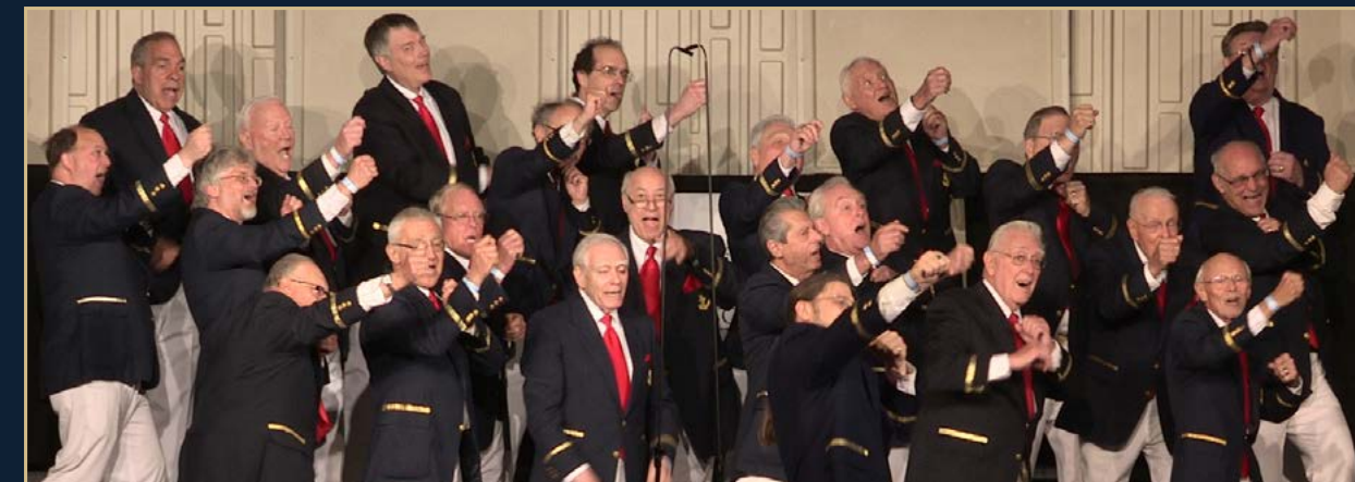
RED BANK CHORUS OF THE ATLANTIC (Plateau AA CHAMPION)