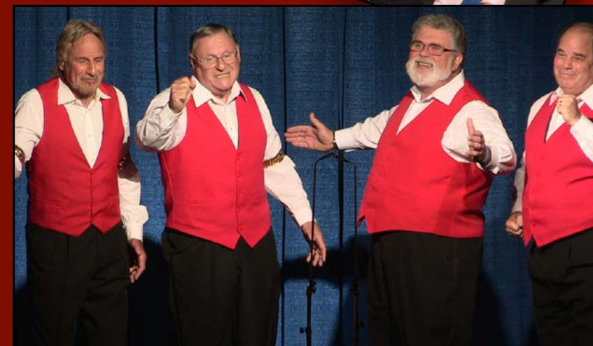
QUARTETS, in order of appearance L-R from TOP: Unaccounted Four Tongue in Cheek Syntax Voice Odyssey Spruce Street (OOD) Heartfelt