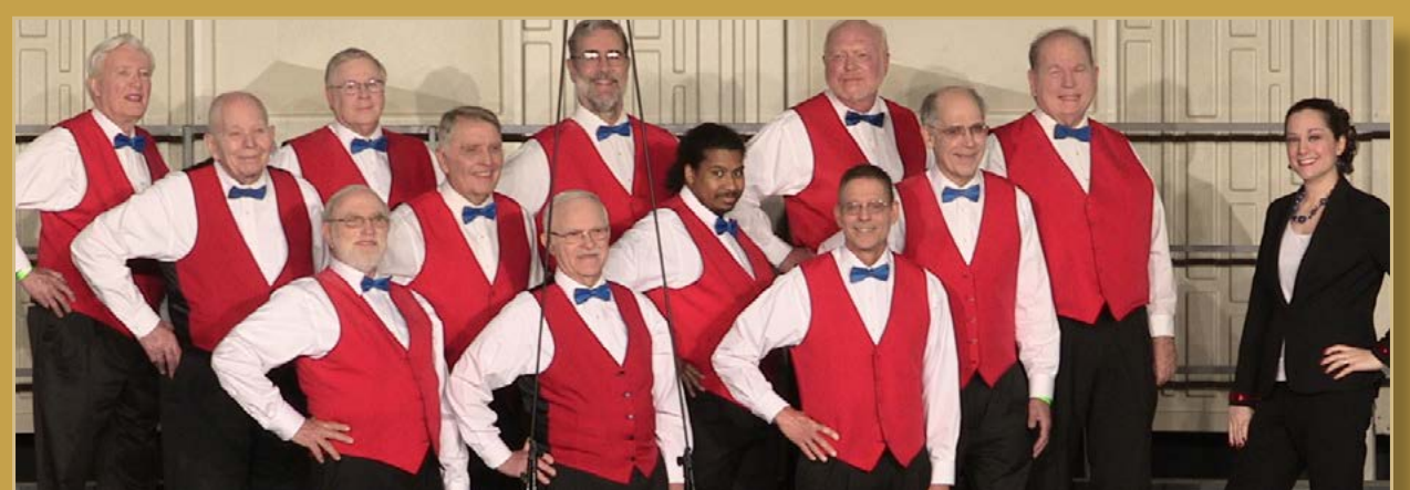
ARLINGTON ARLINGTONES (Plateau A CHAMPION)