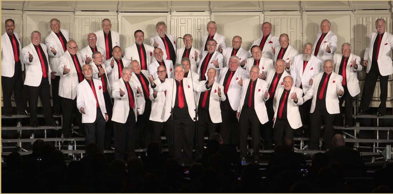
RICHMOND VIRGINIANS SOUTHERN DIVISION CHAMPIONS