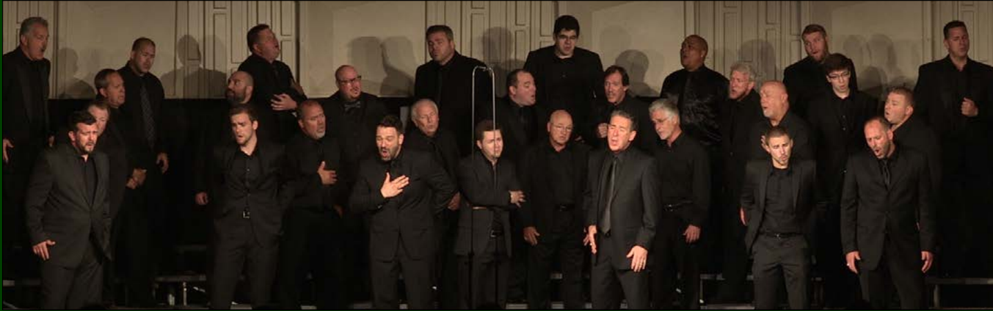
HERSHEY PARKSIDE HARMONY (WESTERN DIVISION CHORUS CHAMPION)