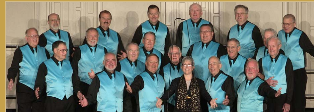
SMITH MOUNTAIN LAKE HARMENEERS