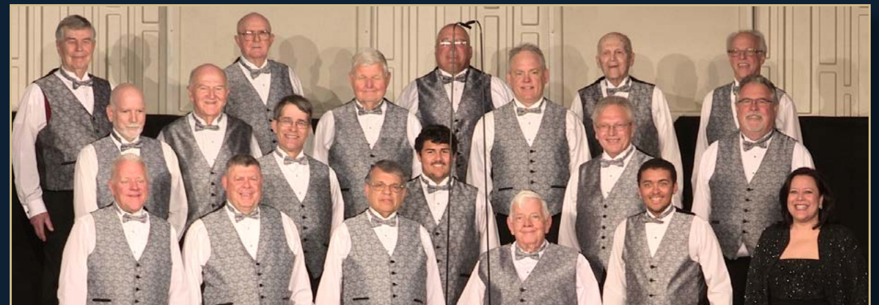
MILFORD FIRST STATE HARMONIZERS