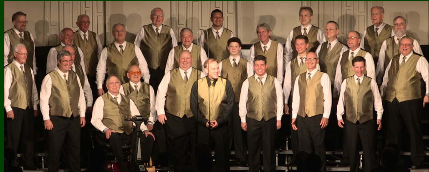
HARFORD COUNTY BAY COUNTRY GENTLEMEN (Plateau AAA CHAMPION)