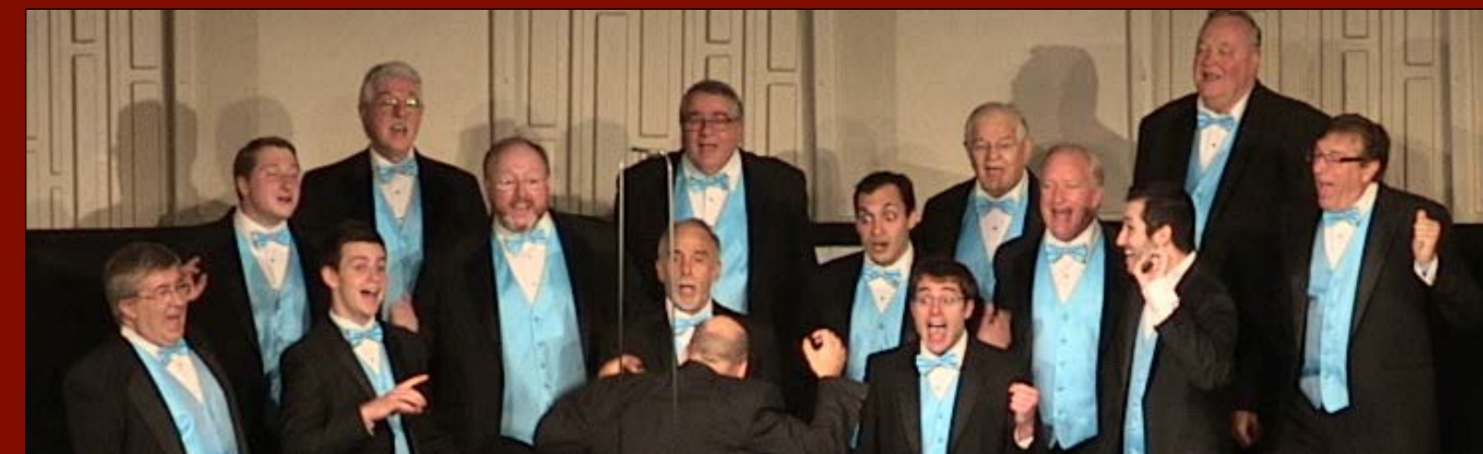
MONTCLAIR DAPPER DANS OF HARMONY (Plateau AAA CHAMPION)