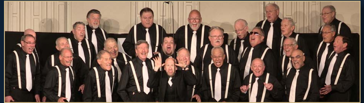
OCEAN COUNTY OCEANAIRE