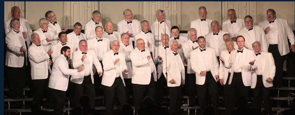
QUEEN ANNE'S COUNTY PRIDE OF DELMARVA