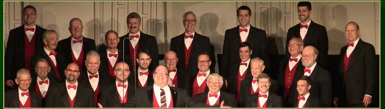
LEWISBURG WEST BRANCH CHORUS