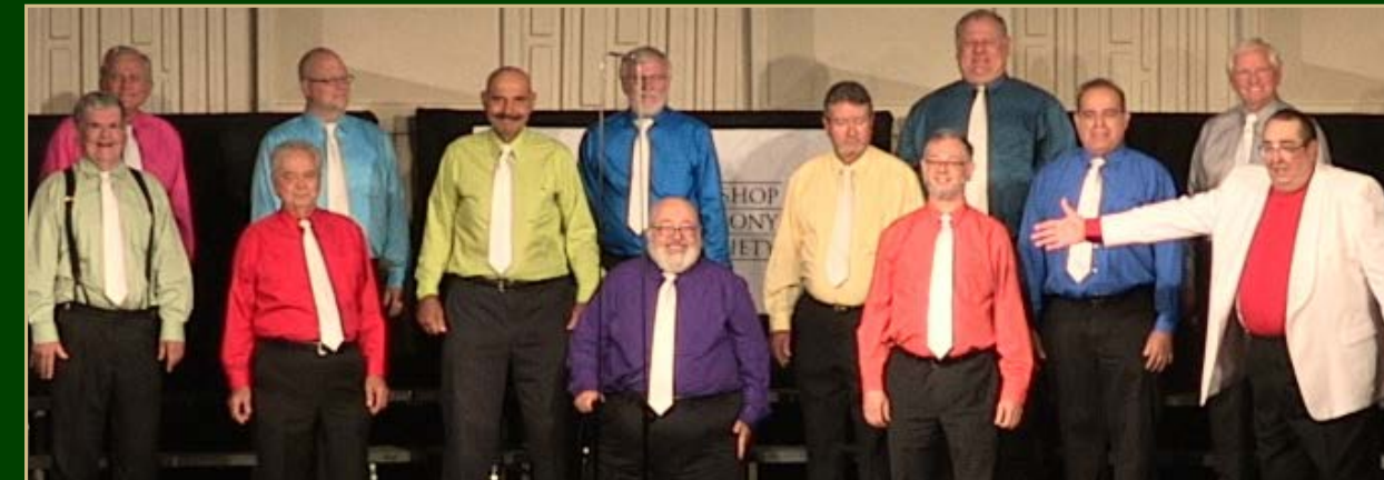
YORK WHITE ROSE CHORUS (Plateau A CHAMPION)