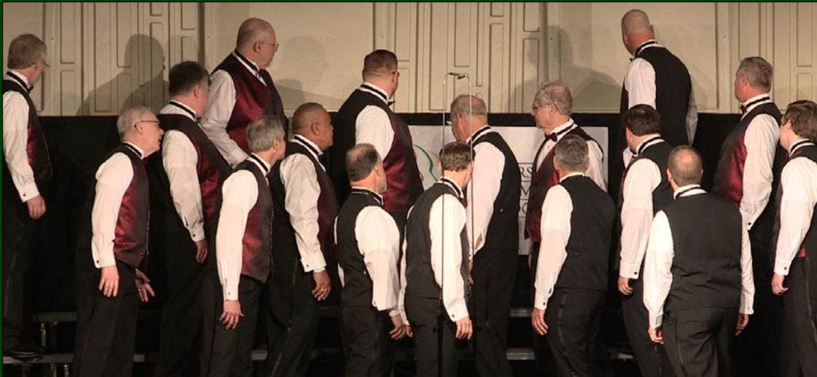
ANNE ARUNDEL SONS OF THE SEVERN