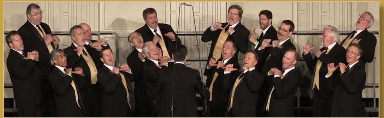
GERMANTOWN HARMONY EXPRESS