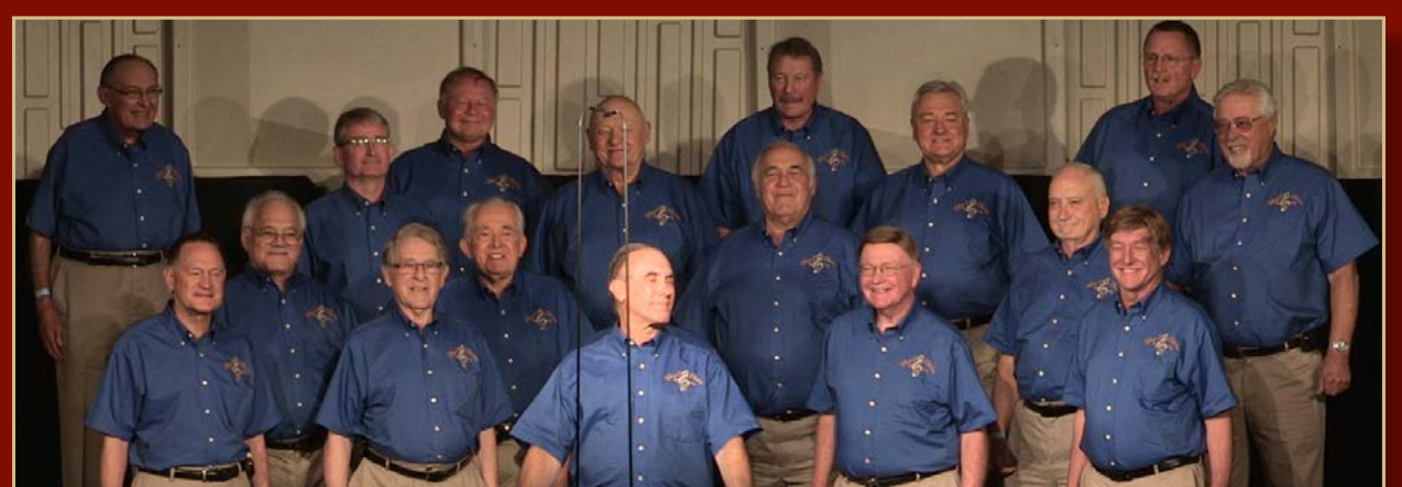
TEANECK-BERGEN COUNTY BLUE CHIP CHORUS (Plateau AA CHAMPION)