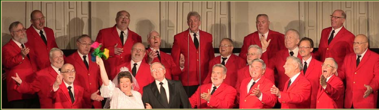
LANCASTER RED ROSE CHORUS