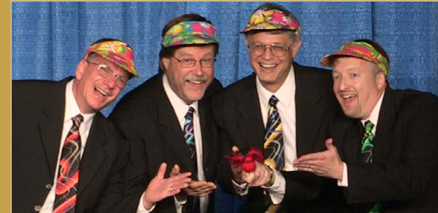
LAST PITCH EFFORT