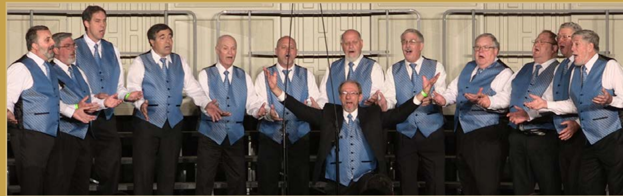
LA PLATA SOUTHERN MIX (Plateau A CHAMPION)