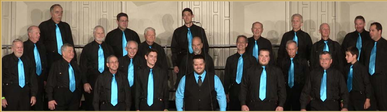
ROANOKE VALLEY VIRGINIA GENTLEMEN