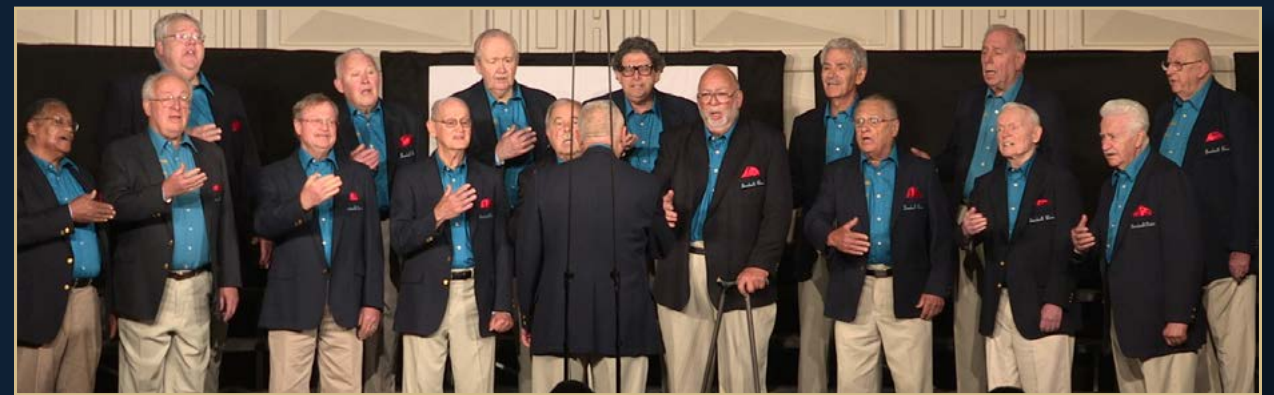
GREATER ATLANTIC CITY BOARDWALK CHORUS (Plateau A CHAMPION)