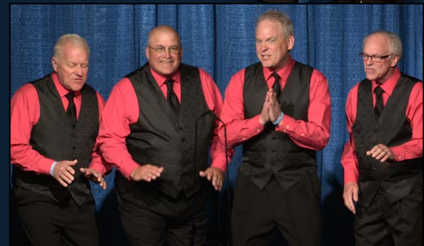
QUARTETS, in order of appearance L-R from TOP: The Old Mill Four (Sr) Four TRAK Sound The Late Entry Two-Faced (Clg) Distinction Backswing