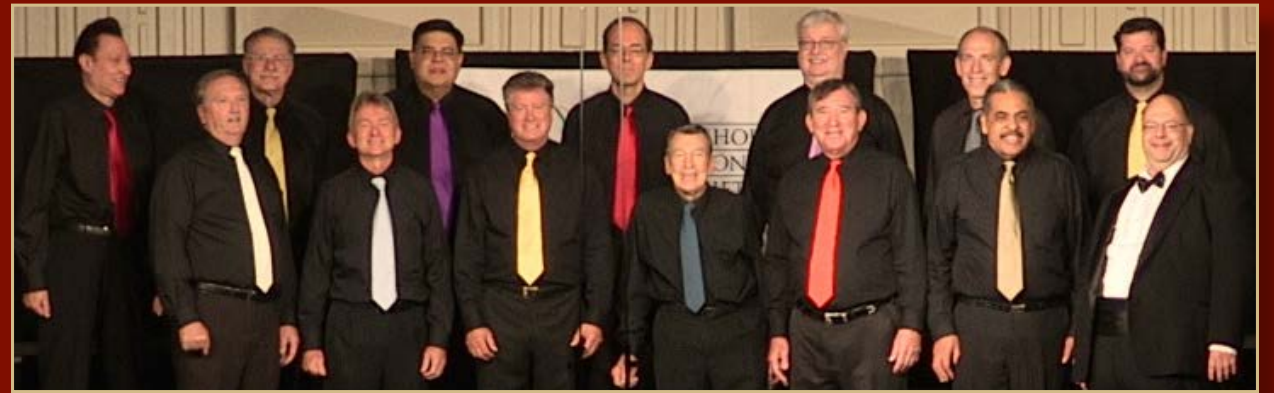
JERSEY HARMONY EXPRESS