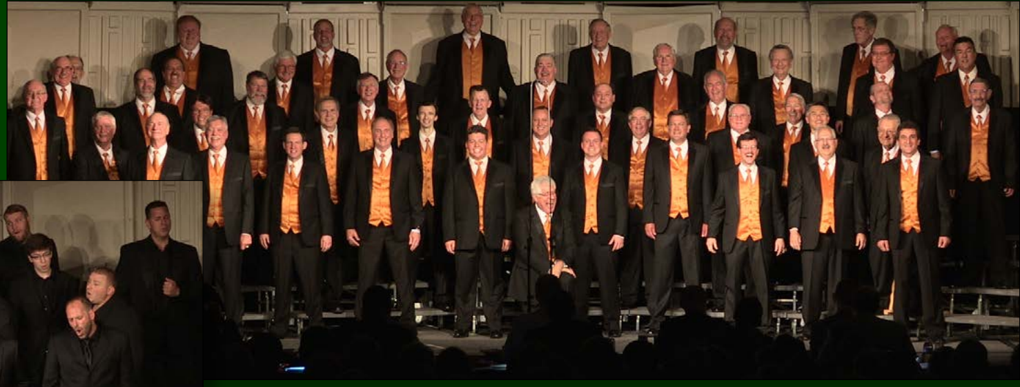
DUNDALK CHORUS OF THE CHESAPEAKE (Plateau AAAA CHAMPION)

For more pictures — LOTS MORE PICTURES! — please visit: www.midatlanticdistrict.com/photos