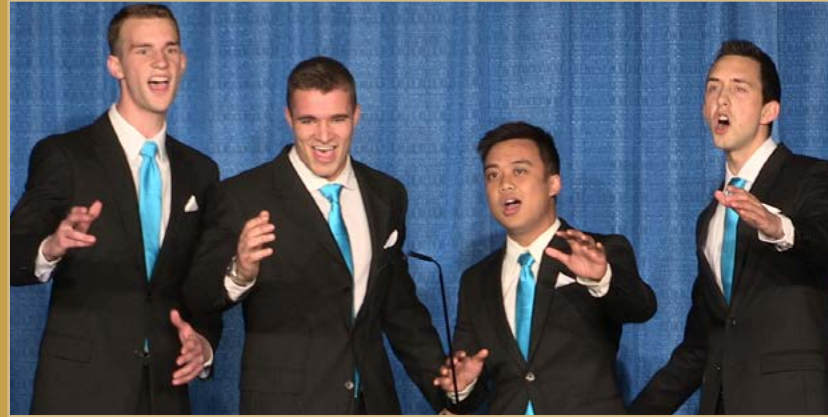
HILLTOP FOUR (College) (OOD)

See you (and your walkie-talkies) in Ocean City, Md. October 23-24