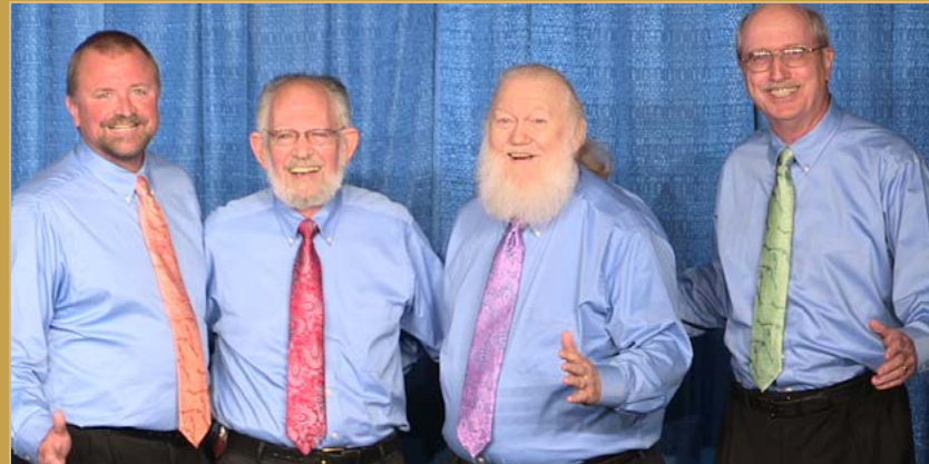
Mic Testers PICK UP FOUR

But that is just one man's opinion. And it is dwarfed by the good feeling that comes out of an event like the Southern Division Convention. Not to mention an accepted proposal!