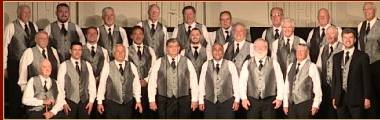
MORRISTOWN MUSIC MEN