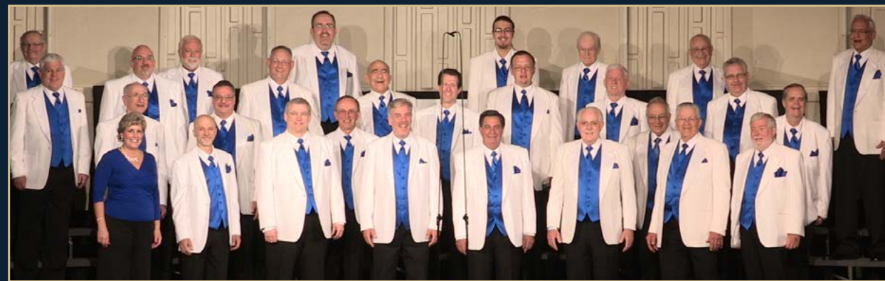
BUCKS COUNTY COUNTRY GENTLEMEN