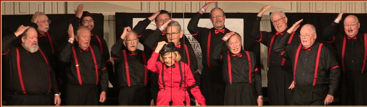
SUSSEX COUNTY HIGH POINT HARMONIZERS