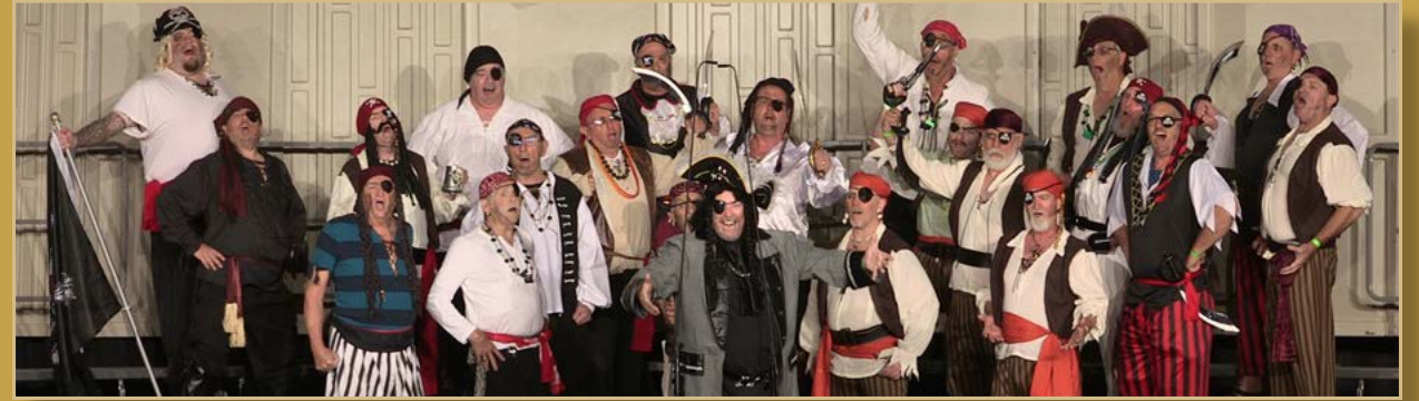
CARROLL COUNTY OLD LINE STATEMEN (OOD)