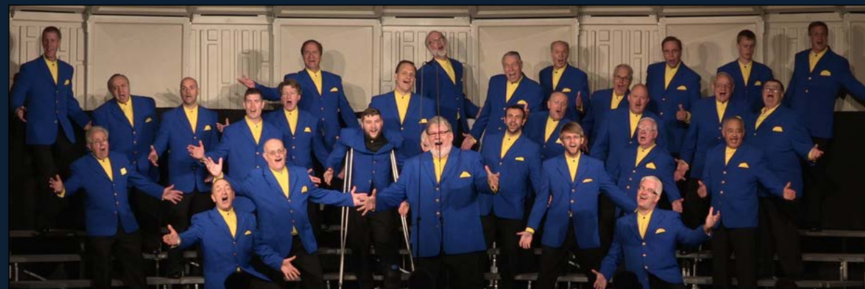
BRYN MAWR MAINLINERS