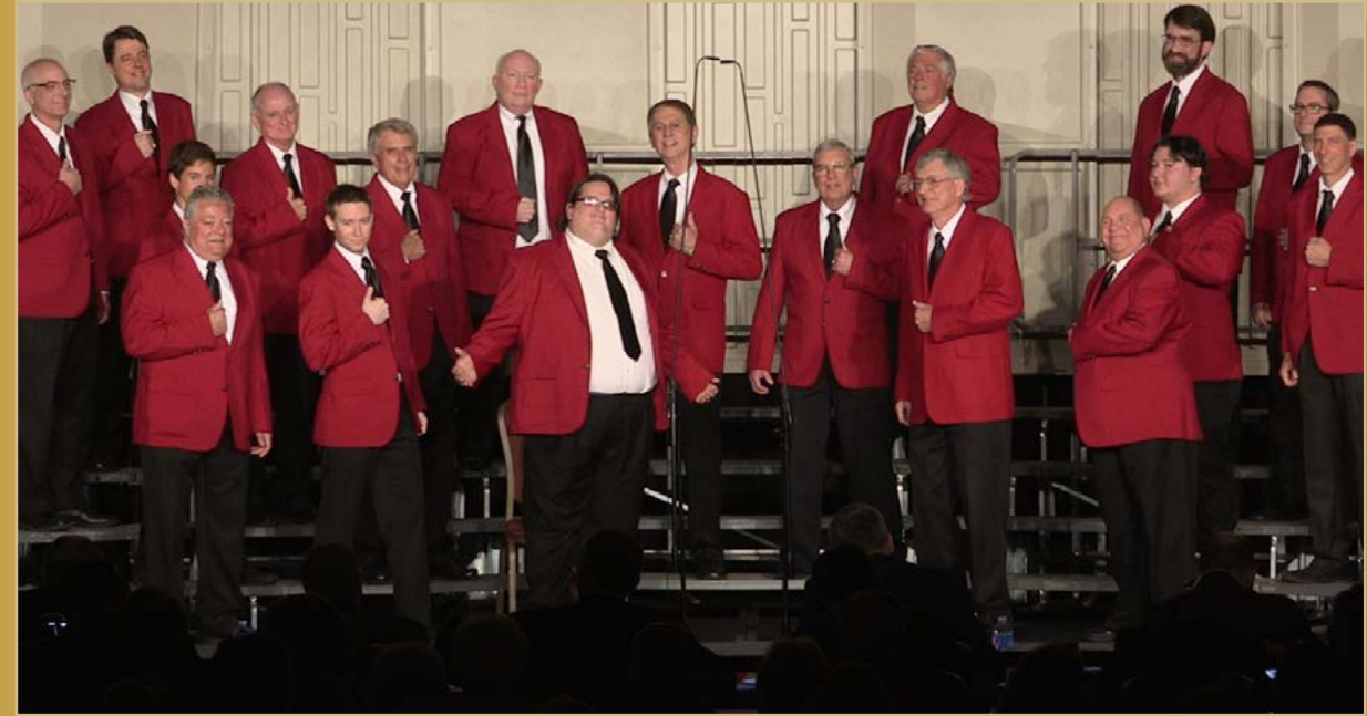
LOUDON COUNTY CHORUS OF THE OLD DOMINION