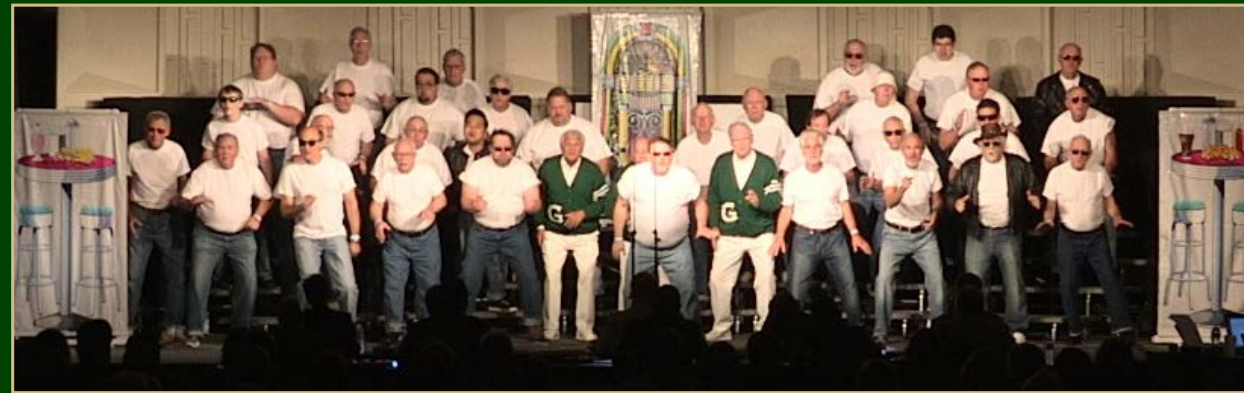
HARRISBURG KEYSTONE CAPITAL CHORUS