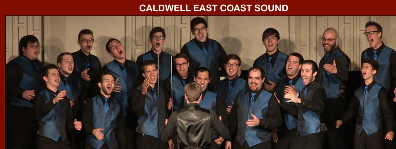
CALDWELL EAST COAST SOUND