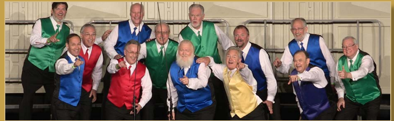
NORFOLK COMMODORE CHORUS