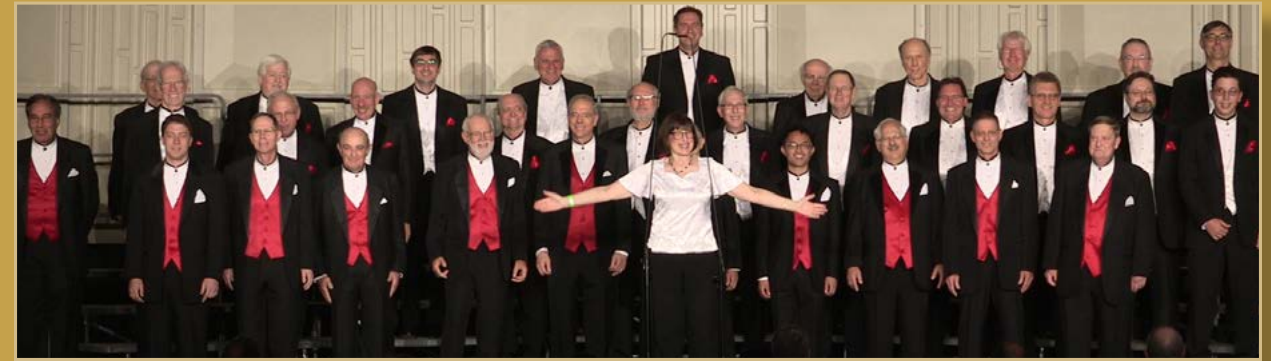
DISTRICT OF COLUMBIA SINGING CAPITAL CHORUS (MOST IMPROVED)