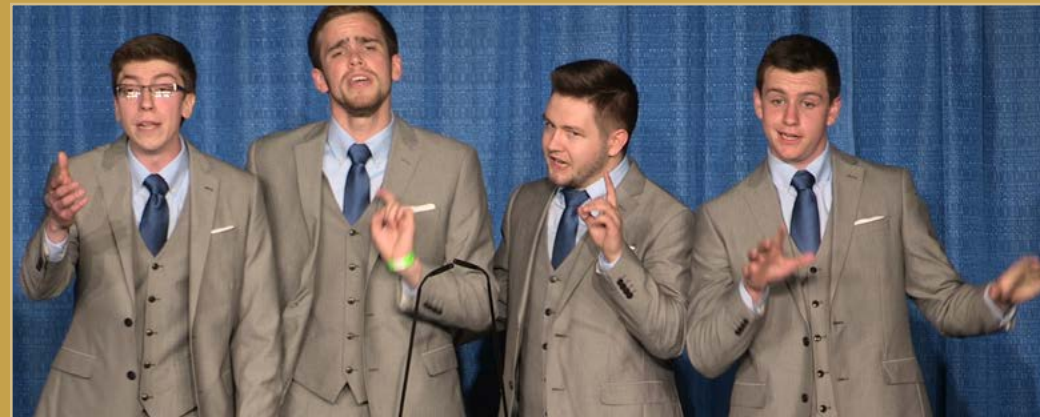
BROTHERS IN ARMS (Collegiate Qualifier)