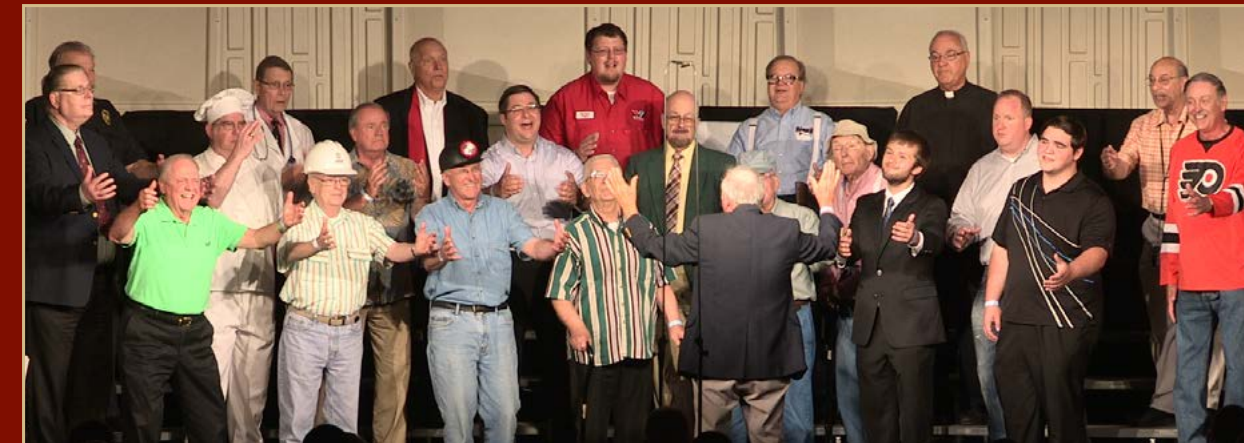
WILKES BARRE WYOMING VALLEY CHORUS