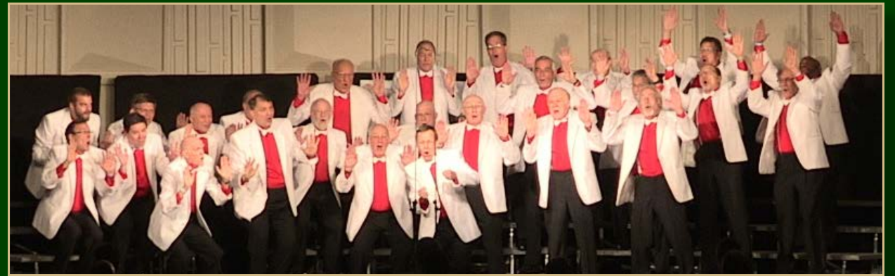
PATAPSCO VALLEY HEART OF MARYLAND CHORUS (MOST IMPROVED)