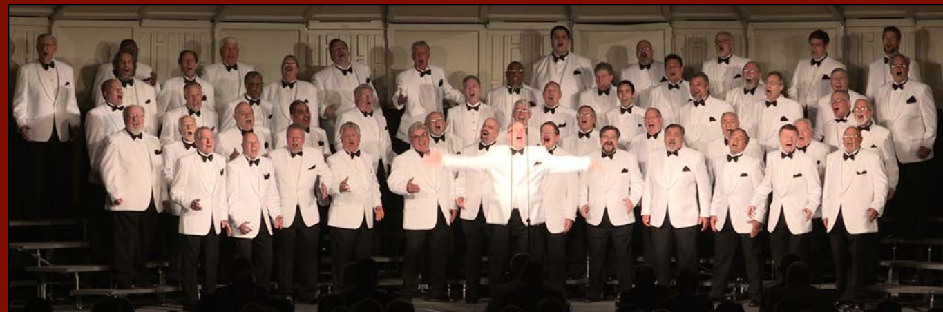
MANHATTAN BIG APPLE CHORUS (NORTHERN DIVISION CHORUS CHAMPION)