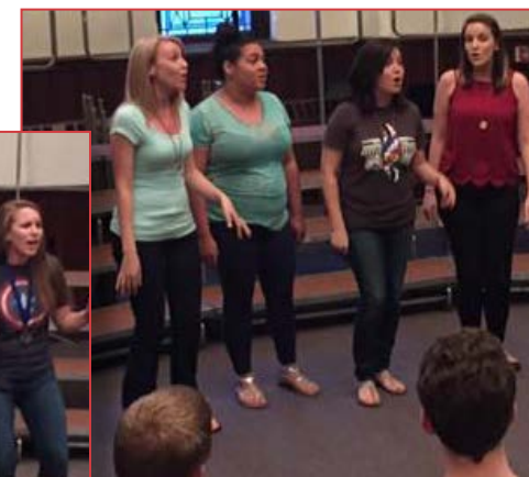
Above, SAI Region #19 Novice Quartet champs Knock Out strut their stuff.