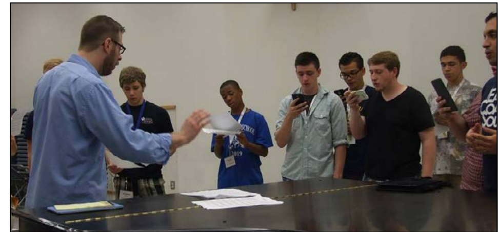
Young men's study session