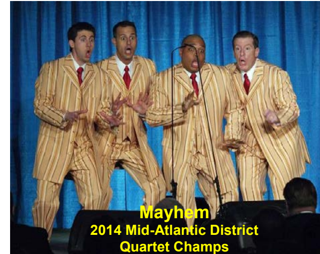
Mayhem 2014 Mid-Atlantic District Quartet Champs

ONCE AGAIN BRINGING YOU THE BEST BARBERSHOP SUMMER SHOW