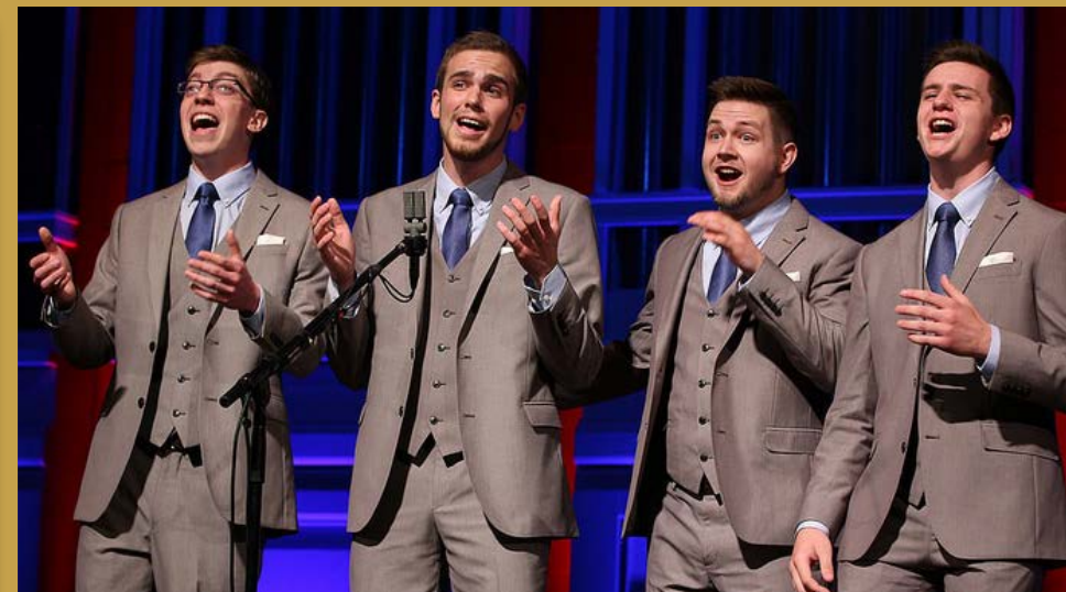
18th Place: BROTHERS IN ARMS