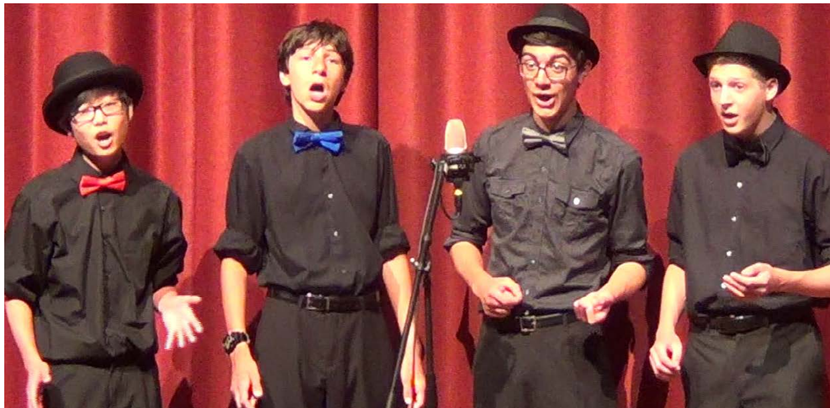
1st Place — Tamanend TARbershop