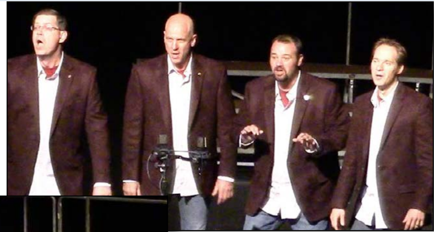
LAST MEN STANDING