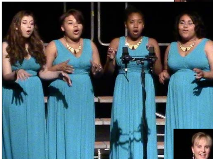
C'EST LA VIE Gaithersburg High School