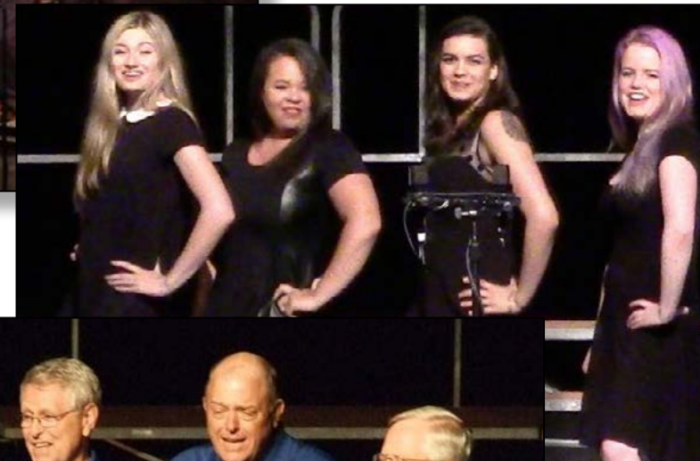
YOUTH RECLAMATION PROJECT