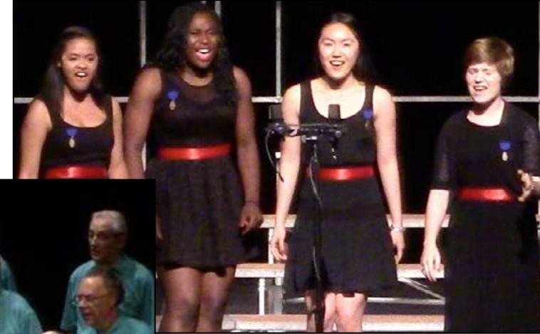
AFTERGLOW from Gaithersburg High School