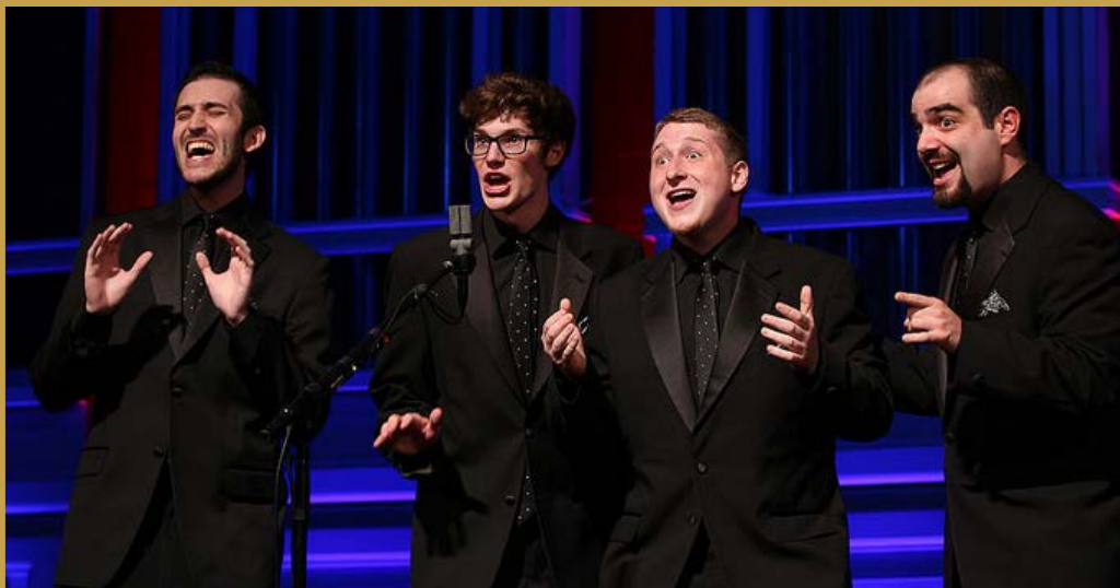
7th Place: STUDENTS OF THE GAME

Posting A-level scores, Trocadero , a quartet from Sweden, beat out 23 other young quartets from around the world to capture the college championship, leading a foreign takeover of the collegiate division. Four of the top five quartets hailed from outside the United States.