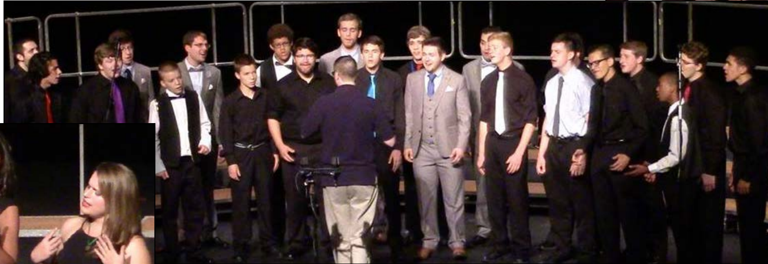
Youths take the stage