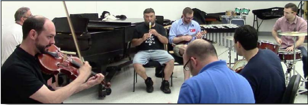
DORM JAM SESSION