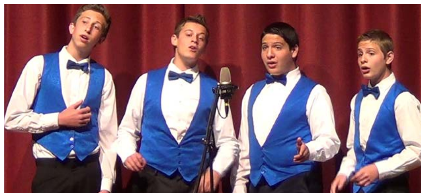
2nd Place — Tamanend Harmonix