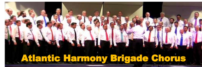
Atlantic Harmony Brigade Chorus

Mayhem AHB Chorus Other Top Quality Quartets