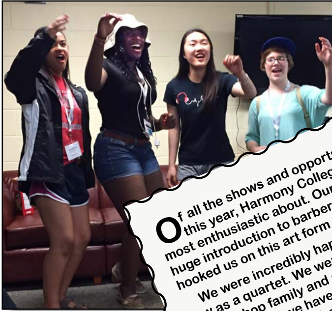
Afterglow Quartet from Gaithersburg High School returned for a second year of coaching at Harmony College East.