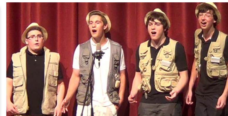
3rd Place — Unami TurtleTones