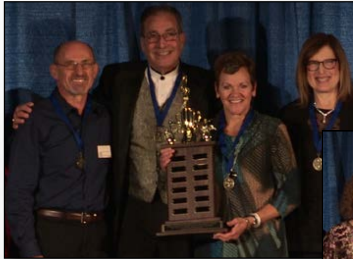
First Place Mixed Voice SERENDIPITY