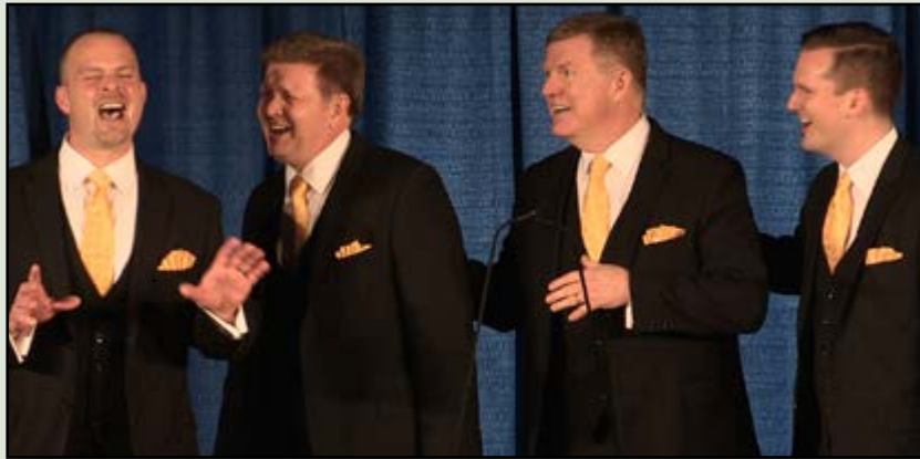
FRANK THE DOG