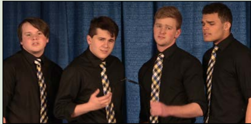
CHORD OF THE RINGS • Vernon Township H.S.