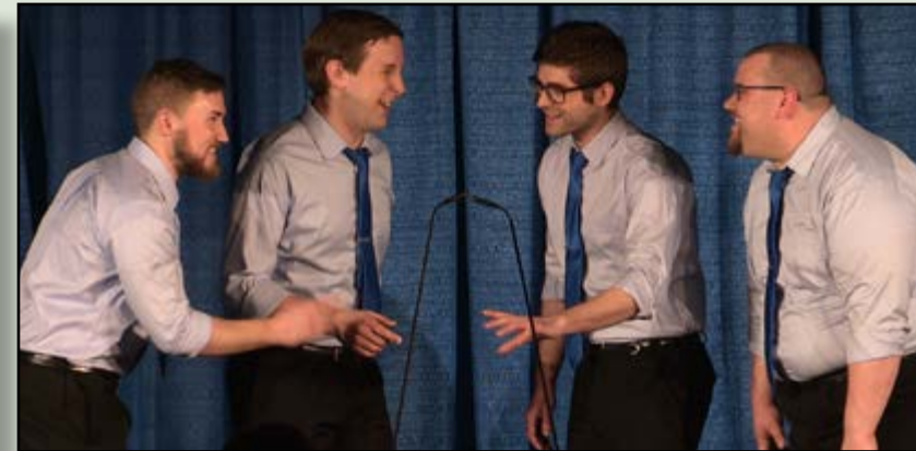
BREAK FROM BLUE COLLAR