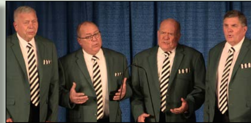
PARTY OF FIVE

Check out the many, many more quartet photos at http://www.midatlanticdistrict.com/photos