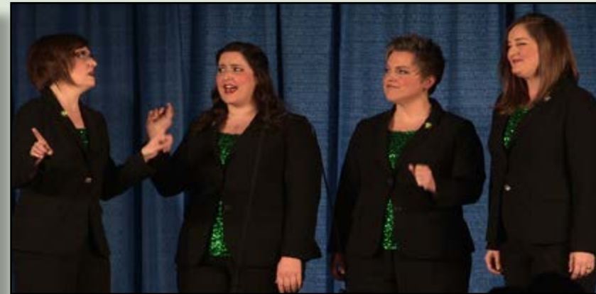
SWEET LUCY (MIC COOLER)