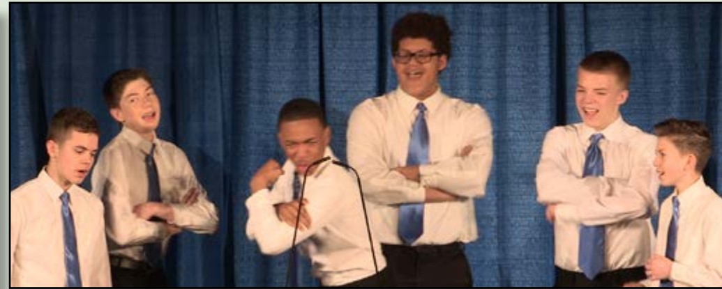
WILDCAT HARMONIZERS • Quinton Township School