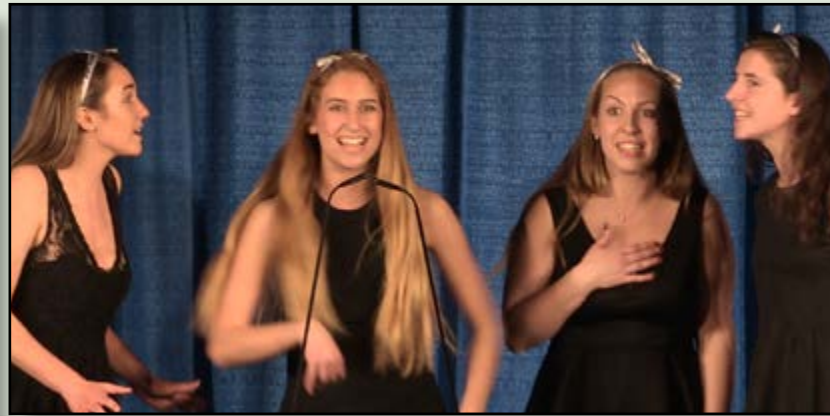
THE ACCIDENTALS • Vernon Township H.S.