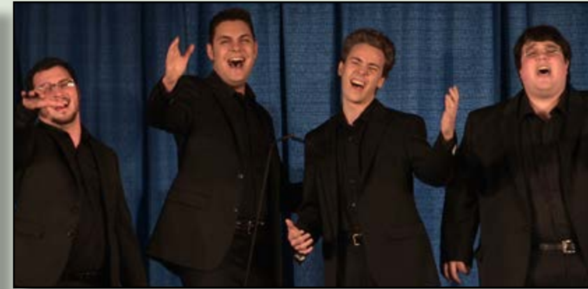
PRATT STREET POWER