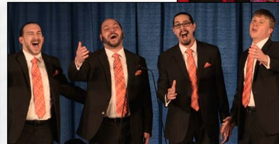
THE CON MEN