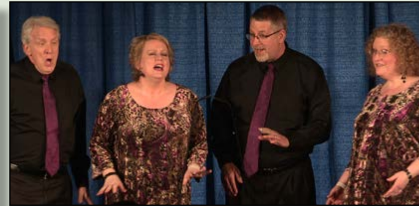
SUM OF EACH