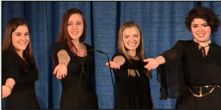
HARMONIA • Tamanend M.S.