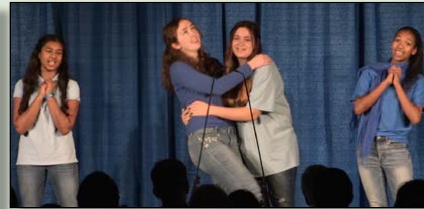
QUARTER NOTES • Tamanend M.S.