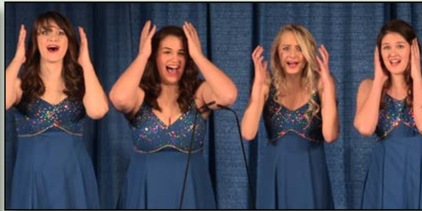
STAR CHORDS • Phillipsburg H.S.