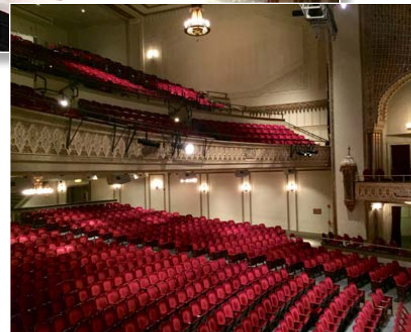
1800 plush theatre seats, spacious lobby and backstage amenities, full-fledged stage, and concert-hall acoustics will make the 2017 District Convention an awesome experience for competitors, audience, and judges.