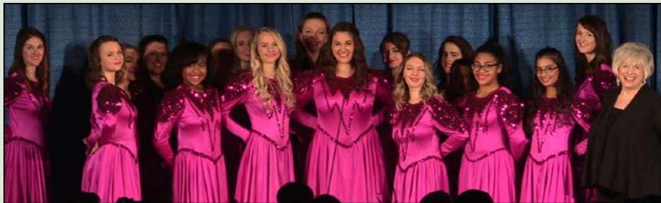
PIECES OF EIGHT • Phillipsburg H.S.