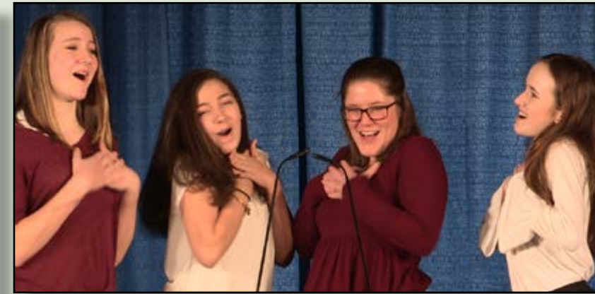
BROADWAY BABIES • Tamanend M.S.