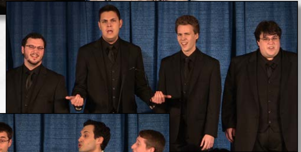
PRATT STREET POWER