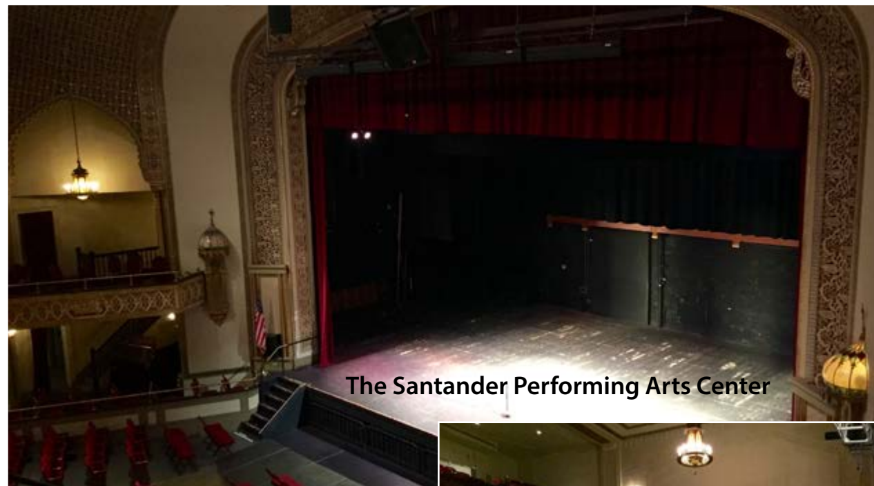
The Santander Performing Arts Center

Please also go to the Santander Performing Arts webpage for additional information regarding parking and accommodations.