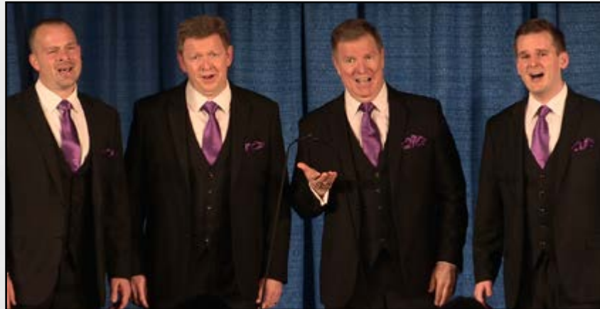
FRANK THE DOG