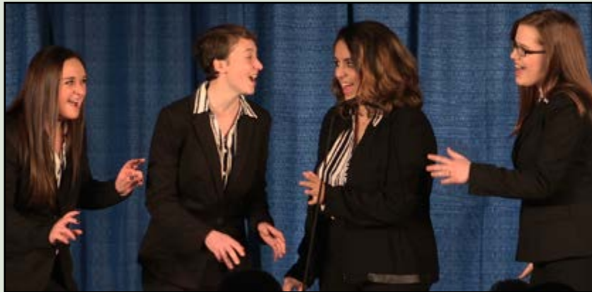
LOOKING SHARP • Vernon Township H.S.