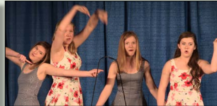
LETTUCE HARMONY • Tamanend M.S.