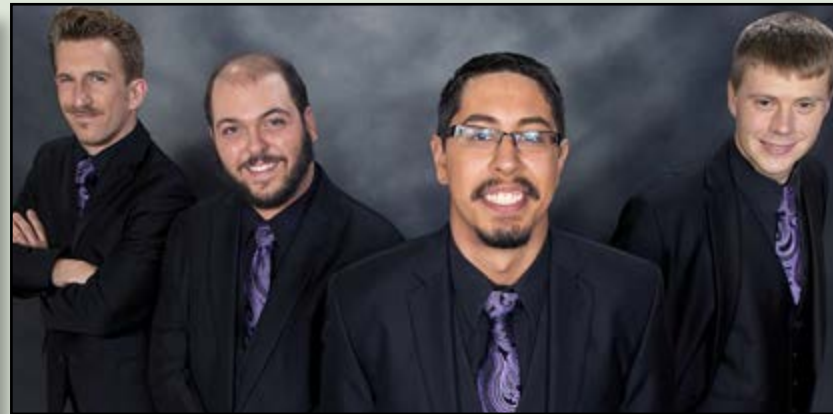
THE CON MEN (OOD)