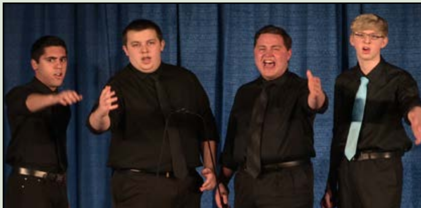
THREE MEN AND A TENOR • Vernon Township H.S.