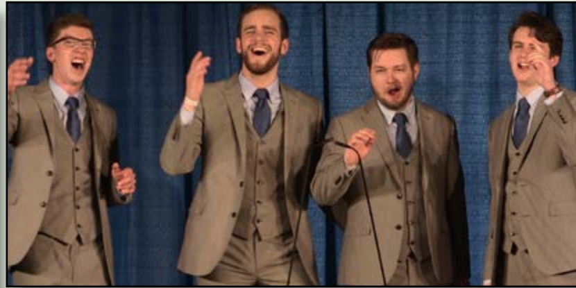
BROTHERS IN ARMS