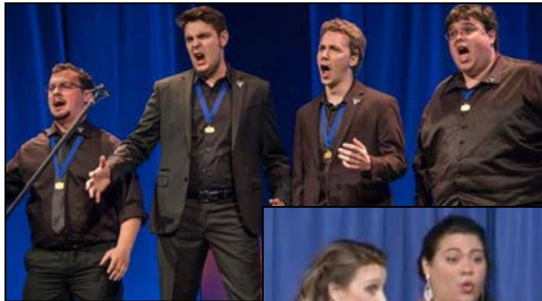
Pratt Street Power and Knock Out will act as teaching quartets along with an all-star cast of coaches and youth leaders.