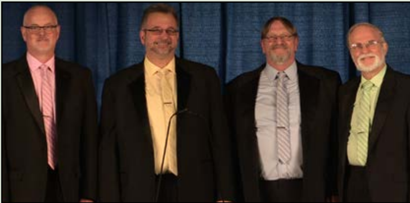
TONGUE IN CHEEK