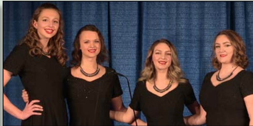
PITCH PLEASE • Phillipsburg H.S.