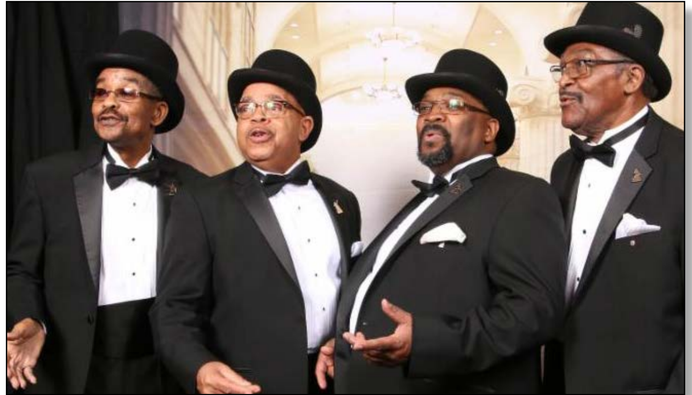
The Grammy Award-Winning Fairfield Four

Tickets available at: thestatetheatre.org