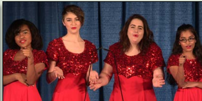
BARBERSHOP BRATS • Phillipsburg H.S.