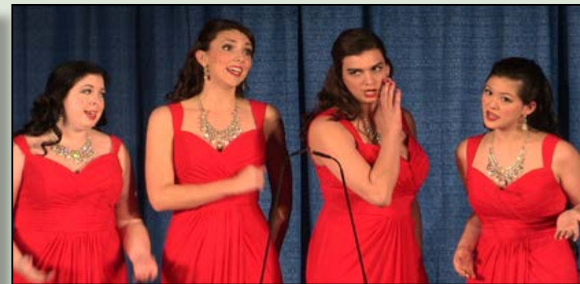
BROWN EYED GIRLS • Mic Coolers