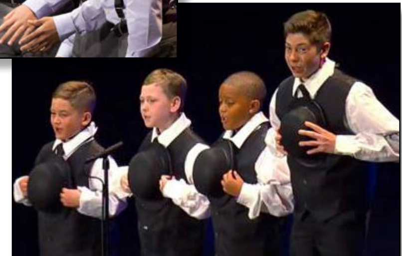
MAD PARTICIPANTS CLOCKWISE FROM LEFT: BROTHERS IN ARMS earns 5th place Bronze Medal, TRADITION places 10th, ELEMENTARY MIX and THE QUINTONES bring down the house as mic coolers.