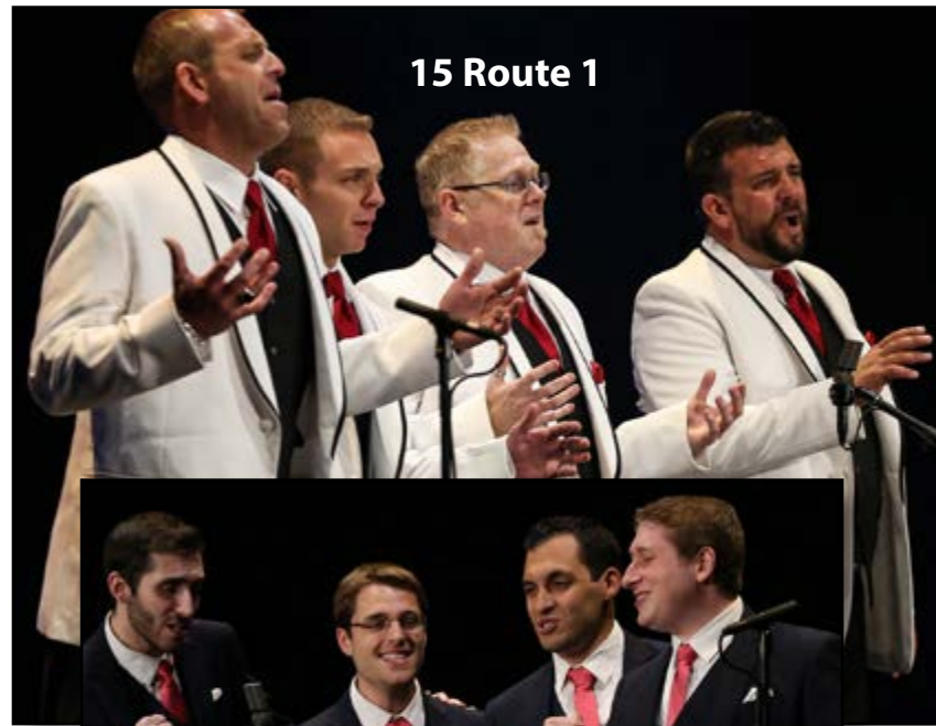
15 Route 1

The crowd cheered as Sunshine District's Main Street was announced 2017 International Quartet Champions. The perennial crowd favorite had clearly indicated their last set would be their last contest appearance so it was doubly pleasing to all barbershoppers present that they walked off with the championship.