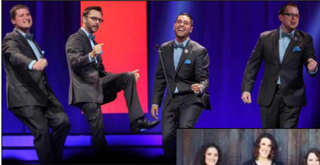
Teaching quartets at Jersey Harmony Explosion! will be 2017 3rd place medalists, After Hours and 2017 Sweet Adeline's 5th place medalists and 2014 Rising Star champions, Class Ring .