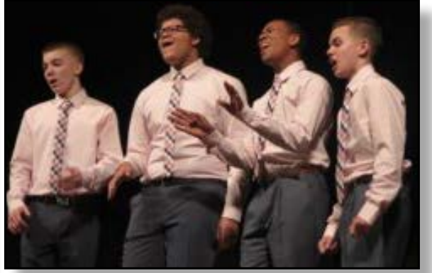
LEFT: 1st Place - Fade to Black ABOVE: 2nd Place - Quin-Tones RIGHT: 3rd Place - Four Score

In order to register for the novice contest, no more than two members of the quartet may have competed at any Barbershop Harmony Society District level contest or any Sweet Adelines Incorporated or Harmony International Regional level contest, and only one member of the quartet may have competed in a quartet at the